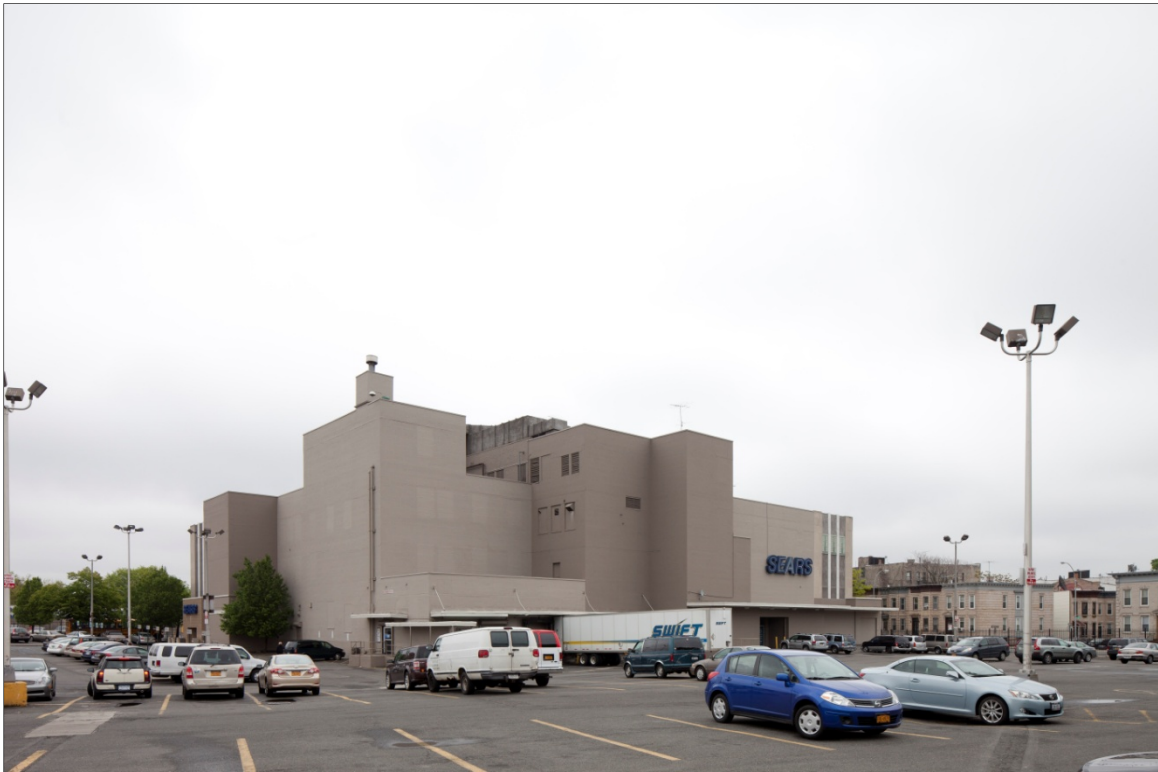
View from parking lot, north and west facades Photo: Christopher D. Brazee, 2012