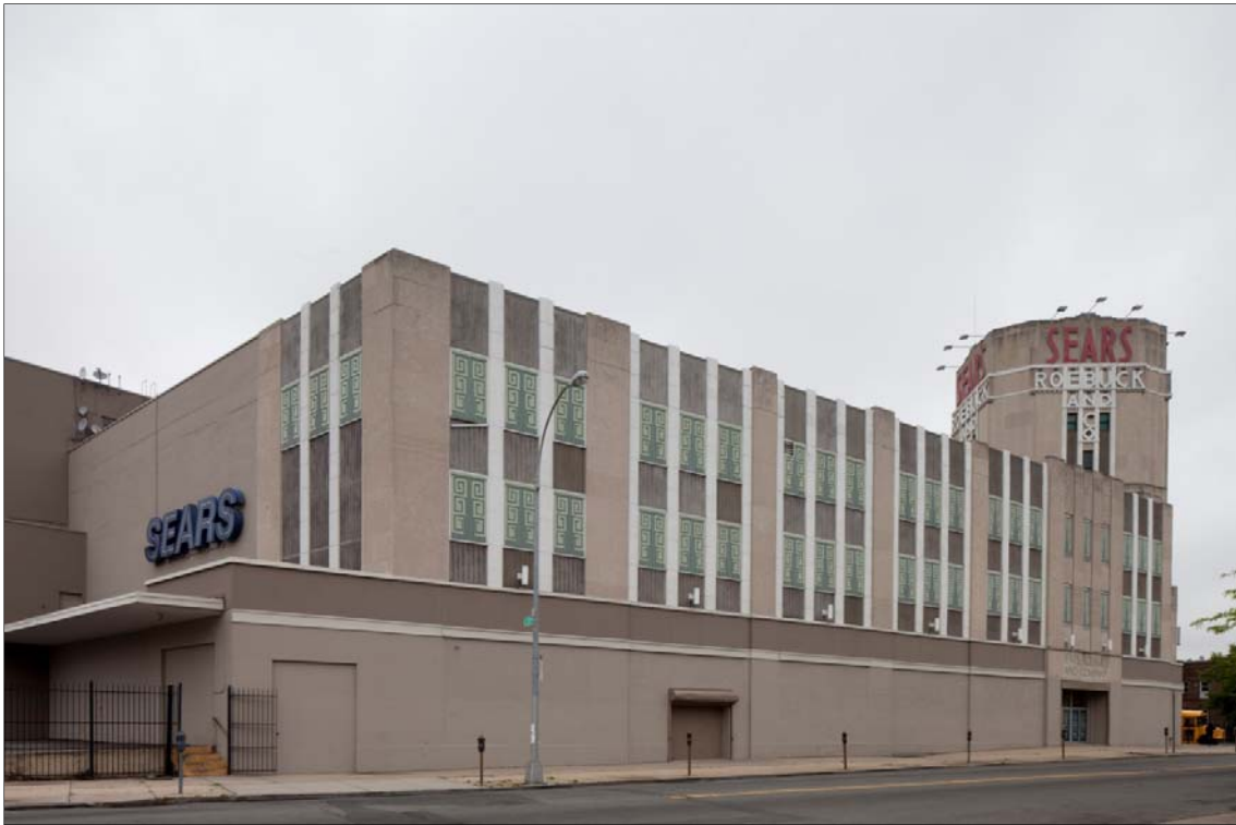
Beverly Road facade Photo: Christopher D. Brazee, 2012