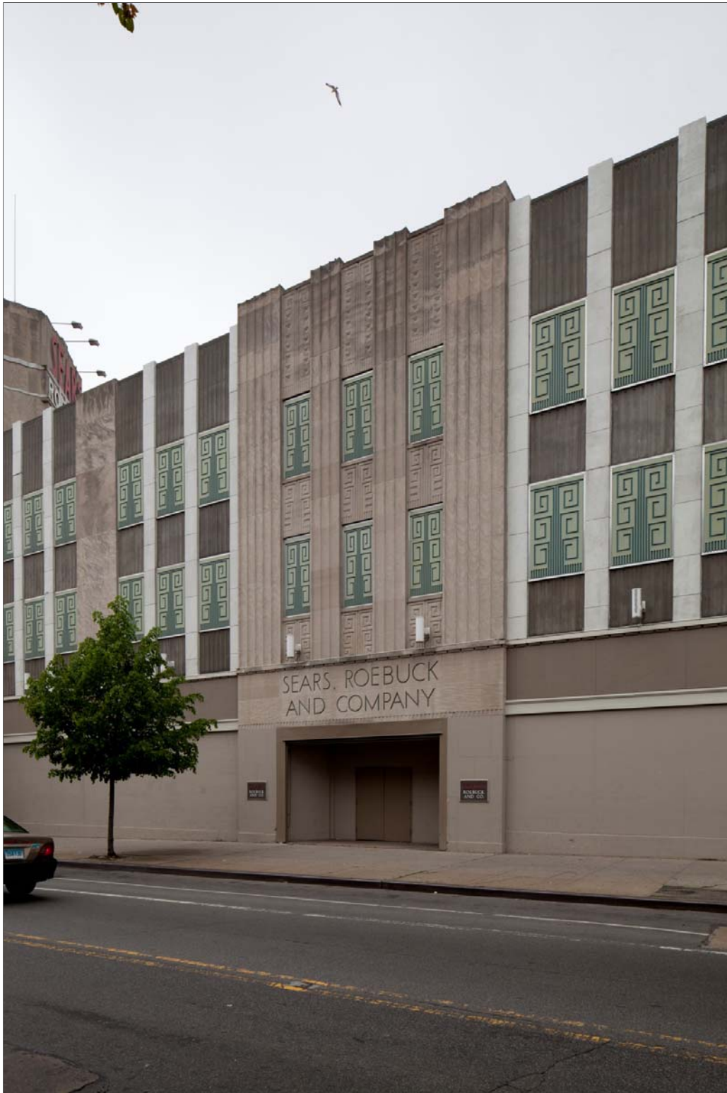
Former entrance, Bedford Avenue