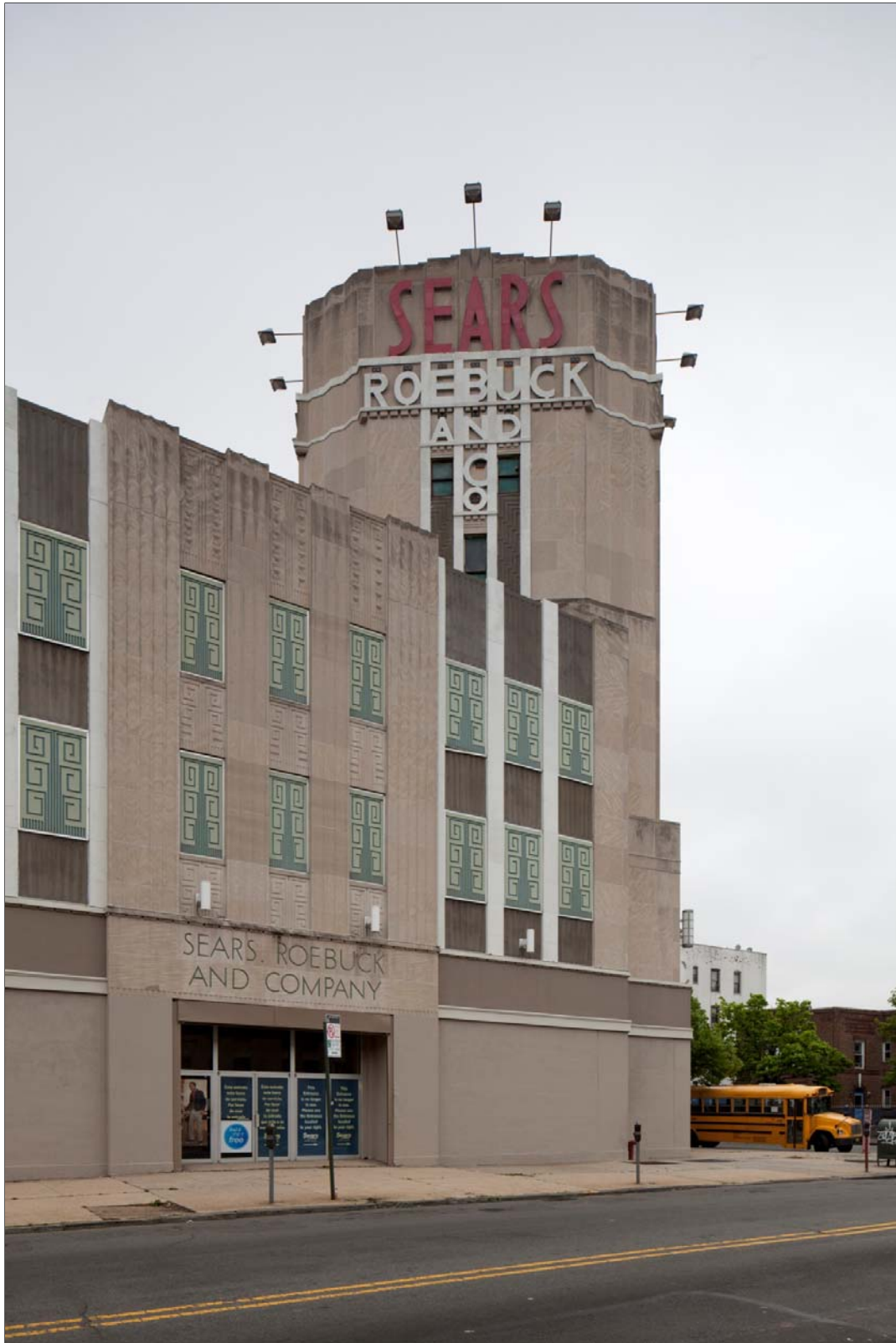
Former entrance, Beverly Road Bedford Avenue on right Photo: Christopher D. Braze, 2012