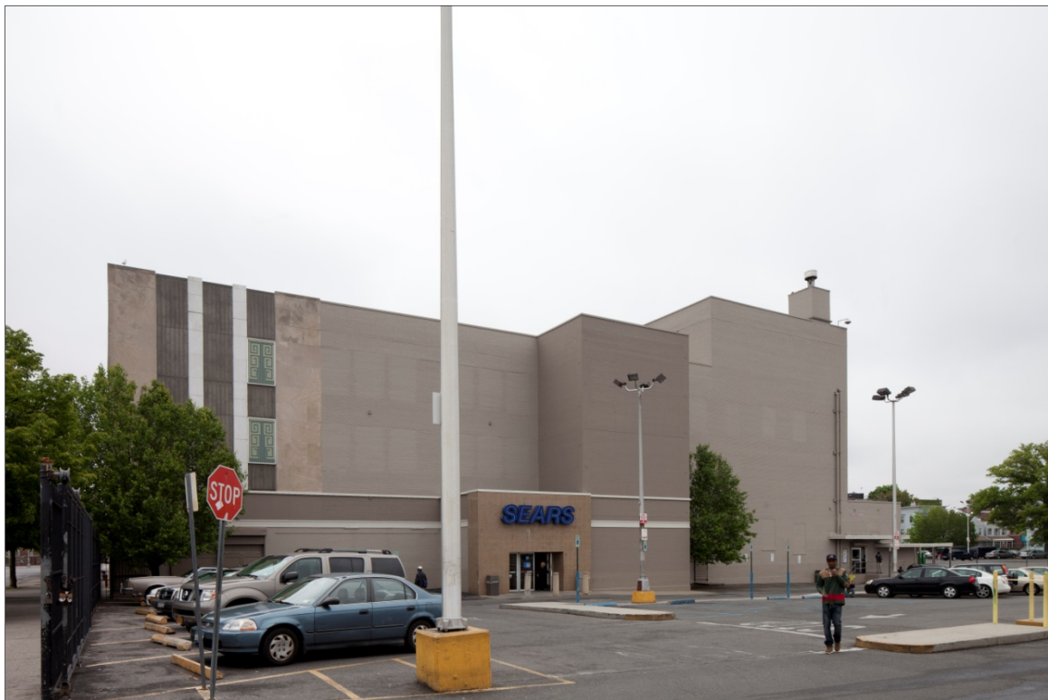
View of entrance from parking lot, Bedford Avenue