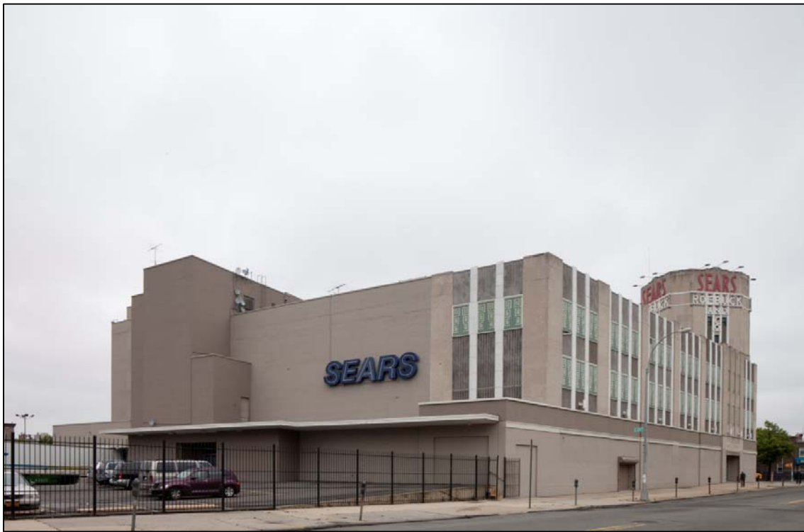
Rear (west) facade, Beverly Road facade Photo: Christopher D. Brazee, 2012