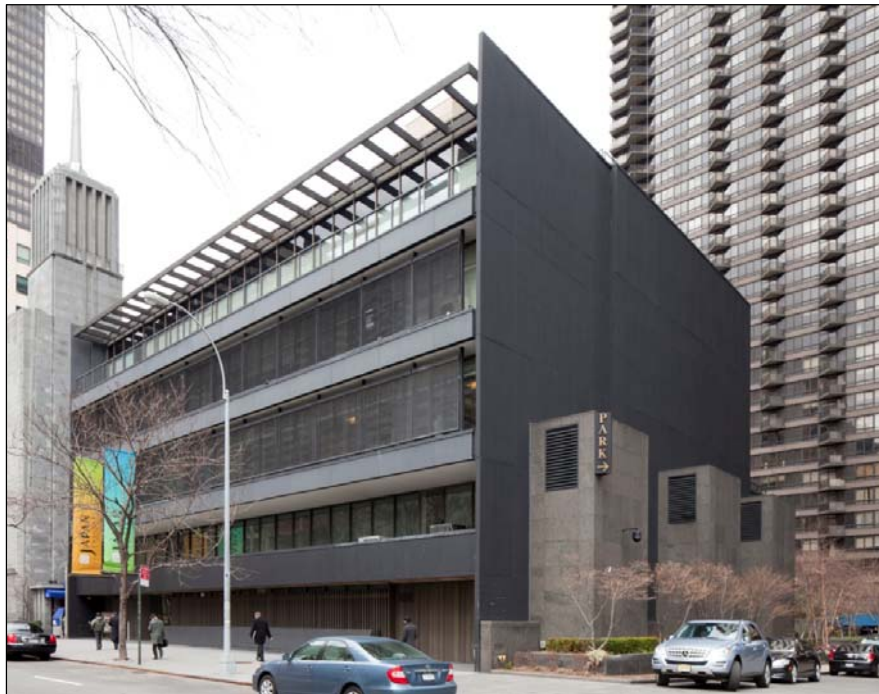
Japan Society Headquarters Rear facade, from 48 th Street Front and east facade, from 47 th Street