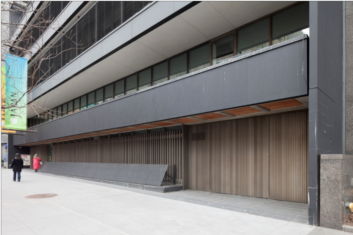
Japan Society Headquarters First story from west (top), from east (bottom)