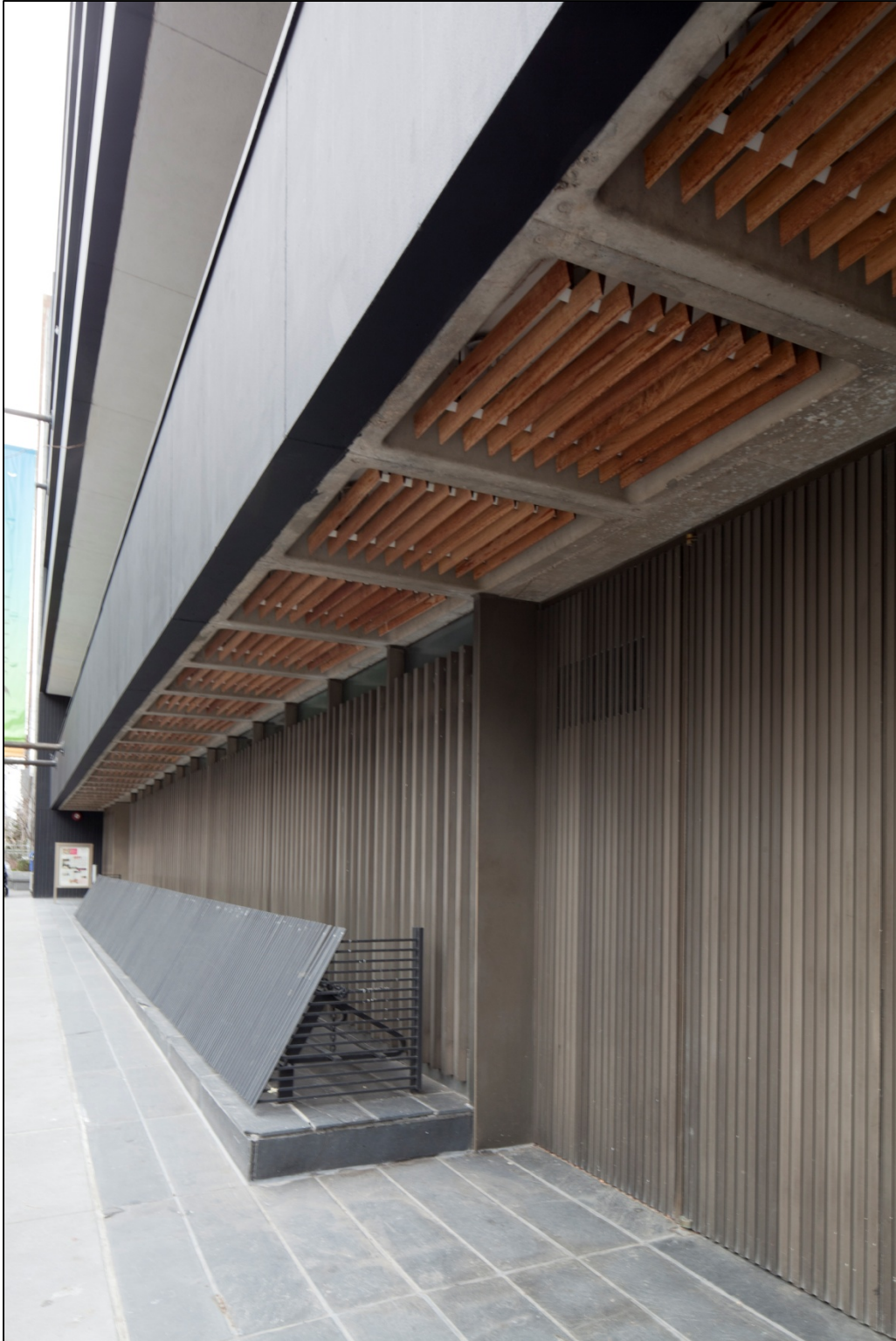
Japan Society Headquarters First story, view west