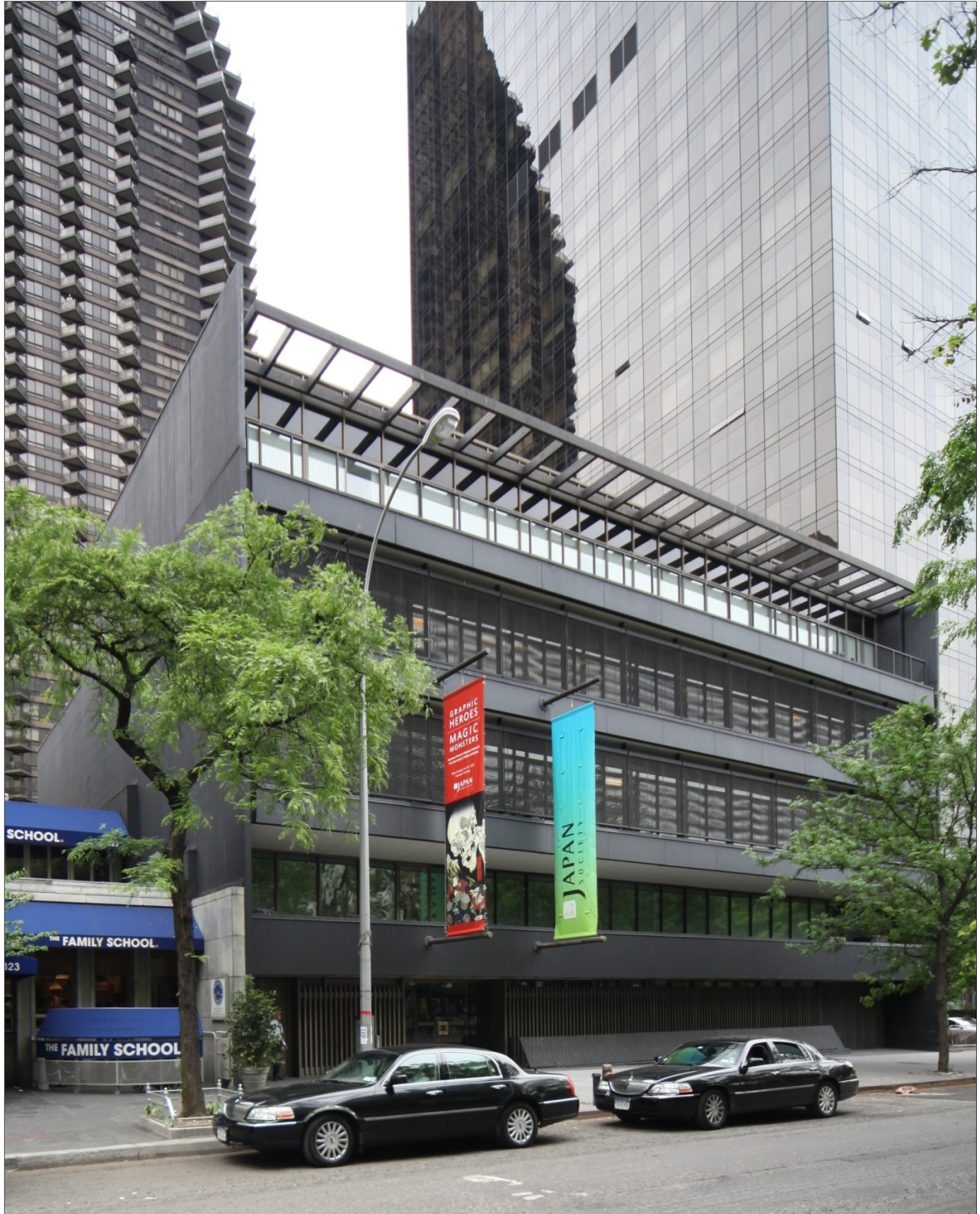
Japan Society Headquarters 333 East 47 th Street (aka 327-333 East 47 th Street), Manhattan