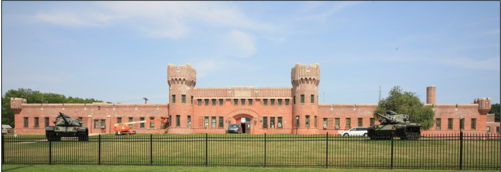
Headquarters Troop, 51st Cavalry Brigade Armory 321 Manor Road, Staten Island Main Facade