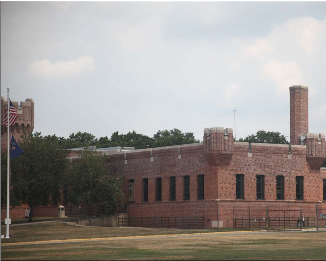
Headquarters Troop, 51st Cavalry Brigade Armory Main (left and center) and south (right) facades of southern wing