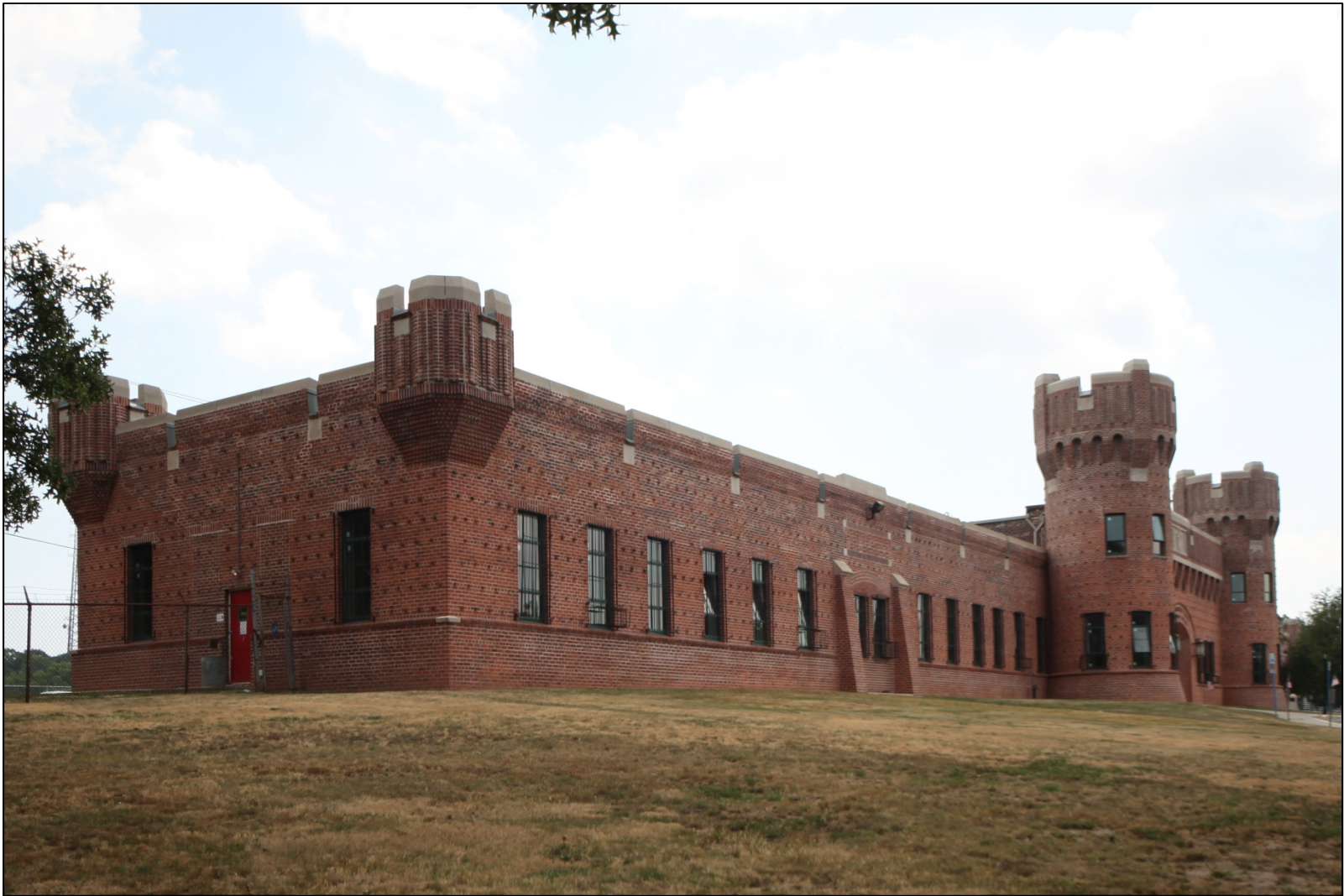
Headquarters Troop, 51st Cavalry Brigade Armory North (left) and main (center) facades of northern wing Photo: Christopher D. Brazee, 2010