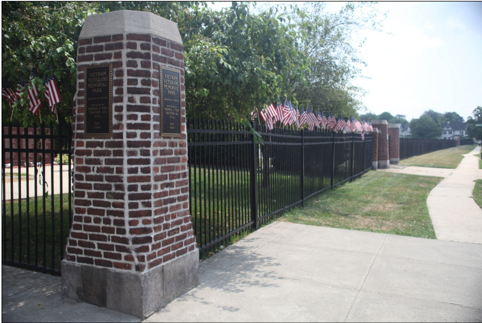
Headquarters Troop, 51st Cavalry Brigade Army Historic brick post and iron picket fence along Manor Road Photo: Christopher D. Braze, 2010