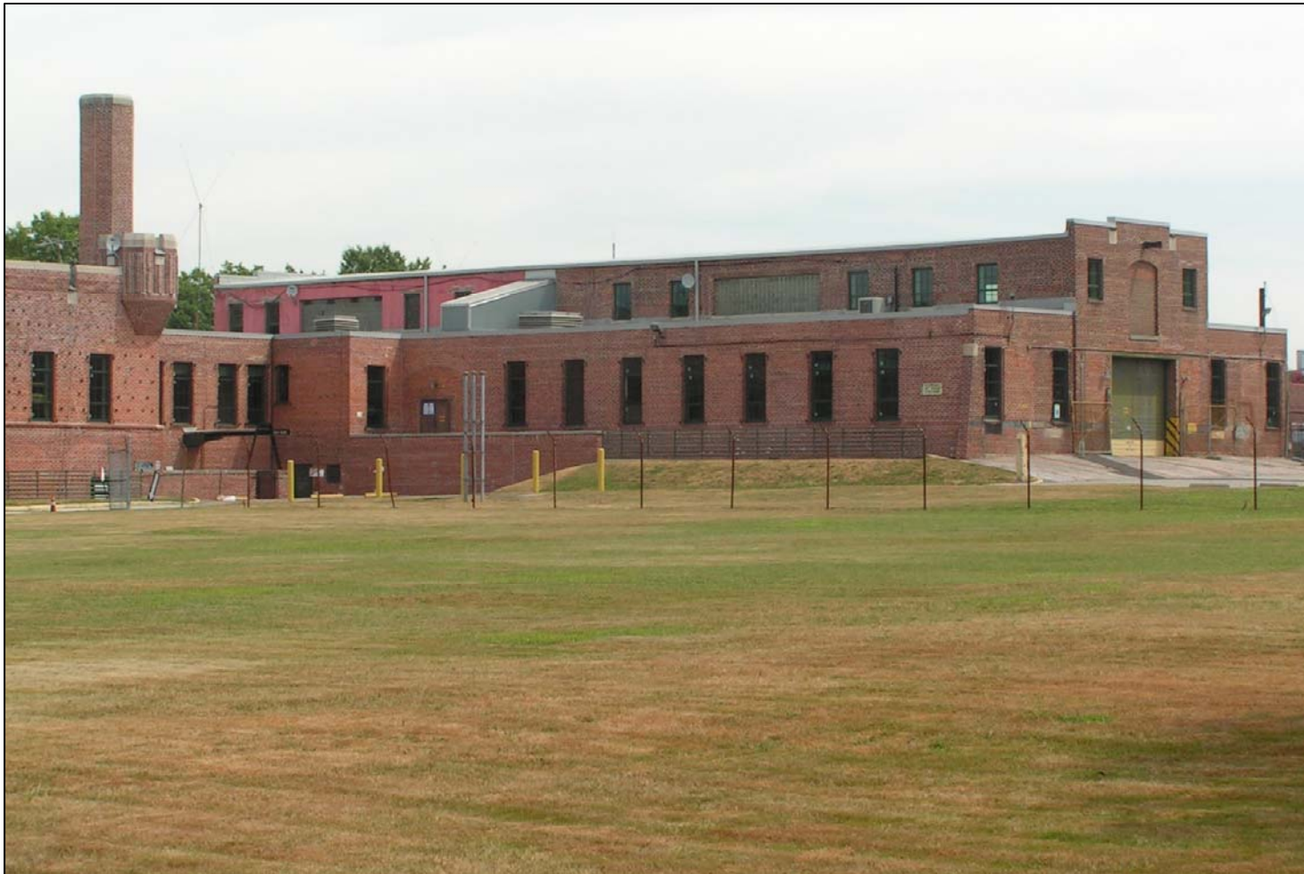
Headquarters Troop, 51st Cavalry Brigade Armory Easternmost two bays of south facade of southern wing (far left) Stable connector and corner extension (left) West facade of stable (center) Main facade of stable (right) Photo: Michael D. Caratzas, 2010