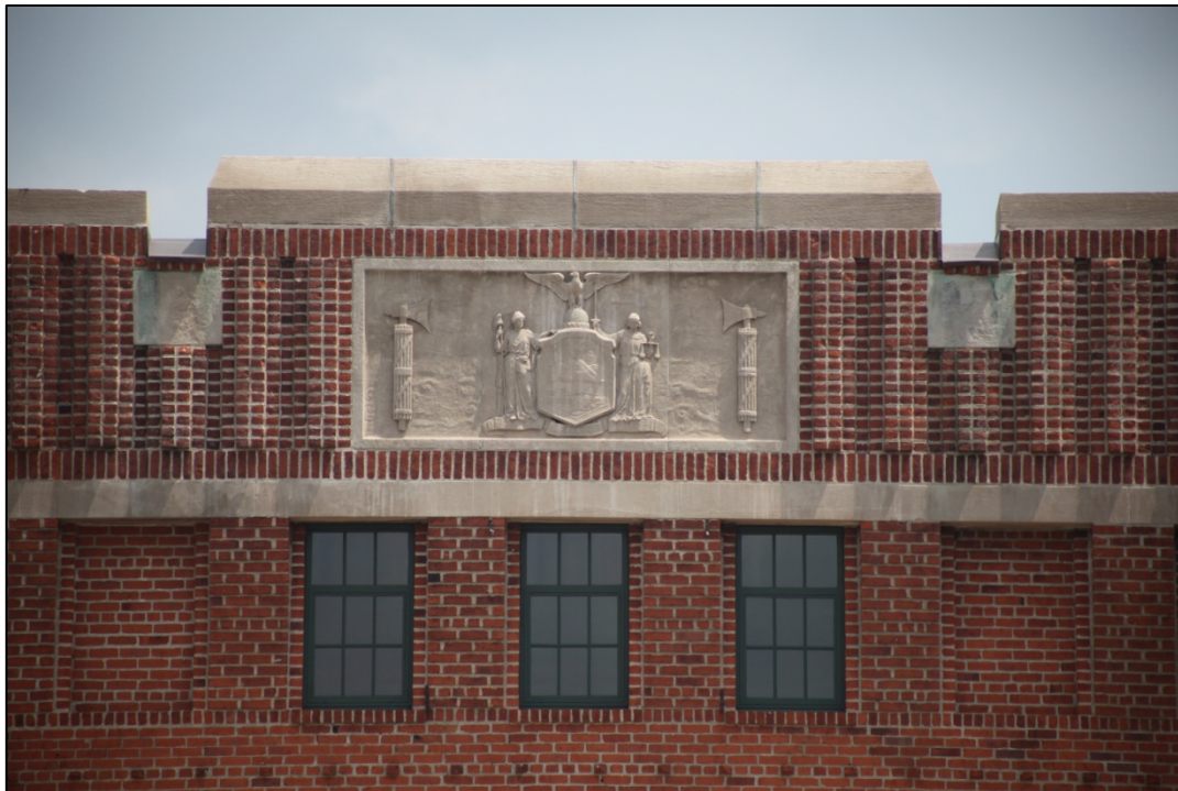
Headquarters Troop, 51st Cavalry Brigade Armory Main entrance (top)