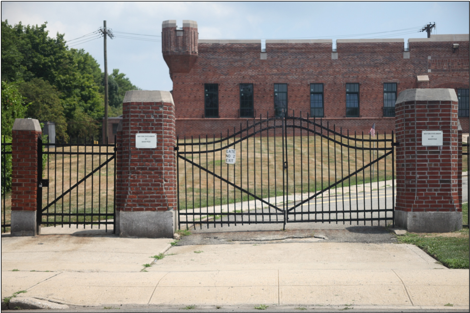
Headquarters Troop, 51st Cavalry Brigade Armory Entrance gate Photo: Christopher D. Brazee, 2010