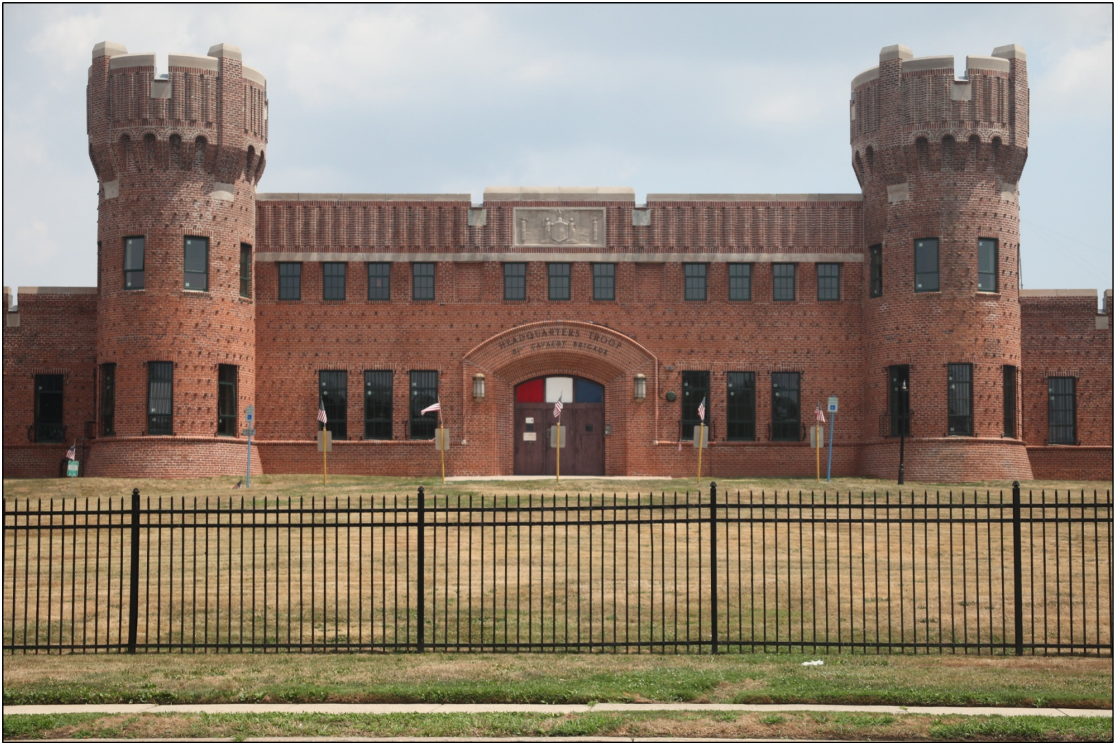
Headquarters Troop, 51st Cavalry Brigade Armory Central portion of main facade