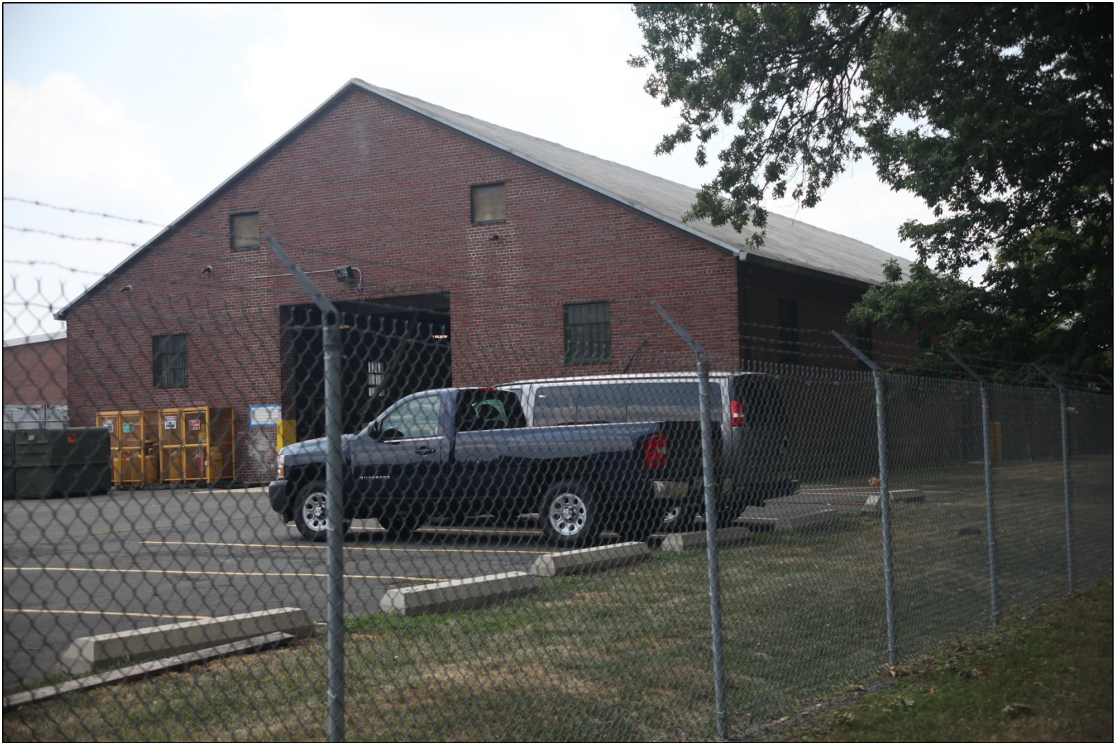
Headquarters Troop, 51st Cavalry Brigade Armory East facade of Motor Vehicle Storage Building and Service Center