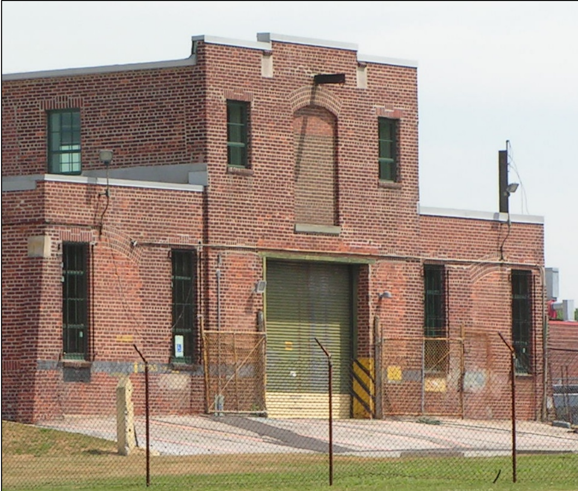
Headquarters Troop, 51st Cavalry Brigade Armory Main stable facade