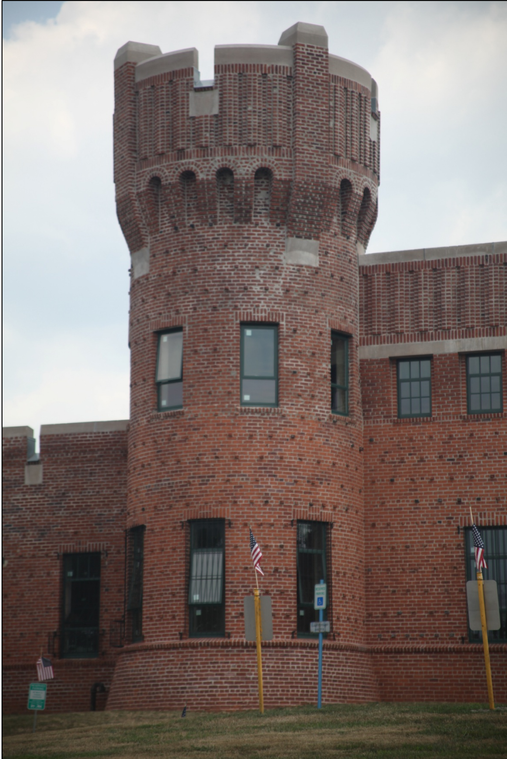
Headquarters Troop, 51st Cavalry Brigade Armory Main facade tower