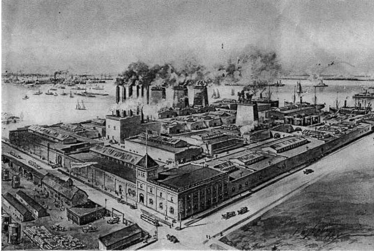
Standard Varnish Works Factory, c. 1914 Source: Staten Island, Borough of Richmond, New York City