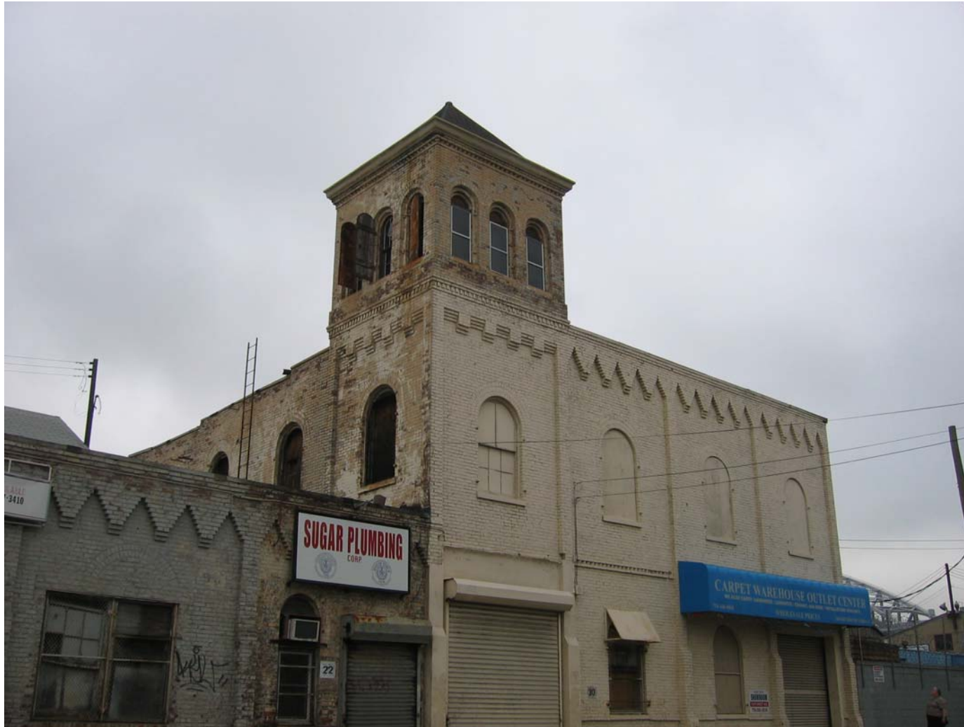
Standard Varnish Works Factory Office Building View from the southwest