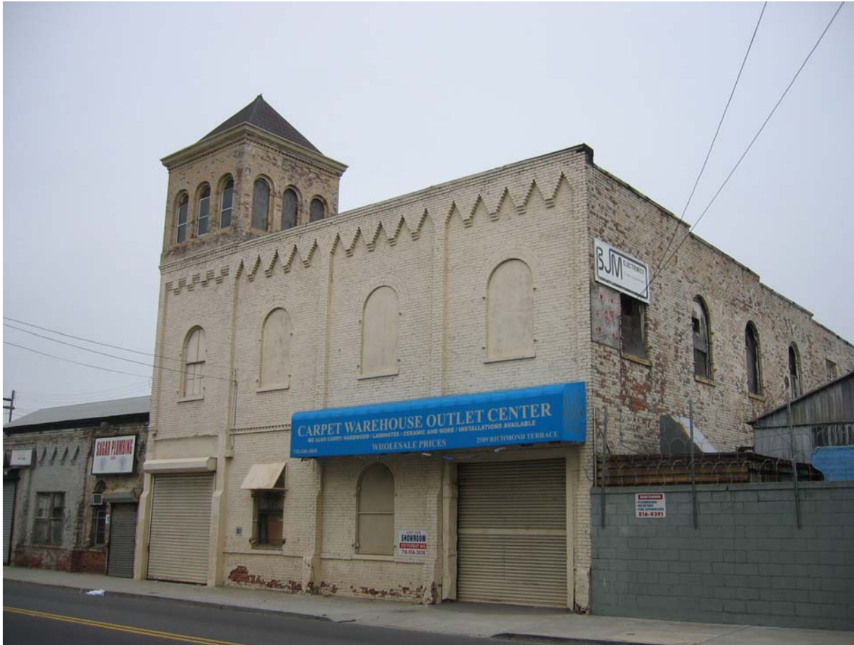
Standard Varnish Works Factory Office Building 2589 Richmond Terrace, Staten Island