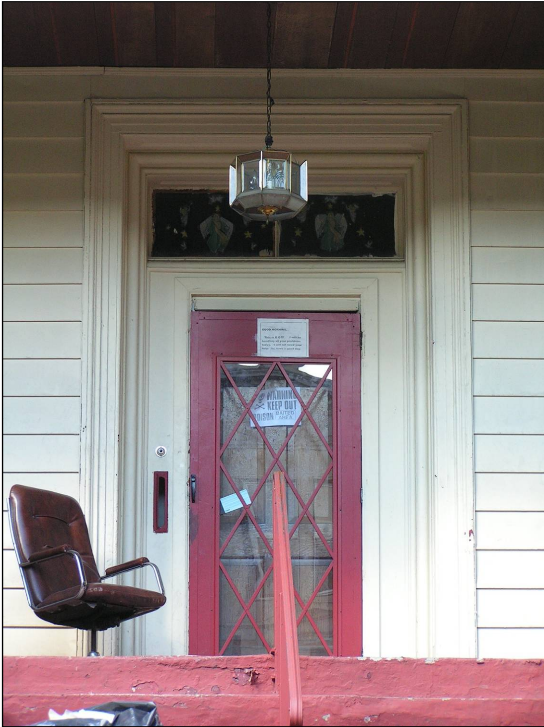
George B. and Susan Elkins House, main entrance detail.