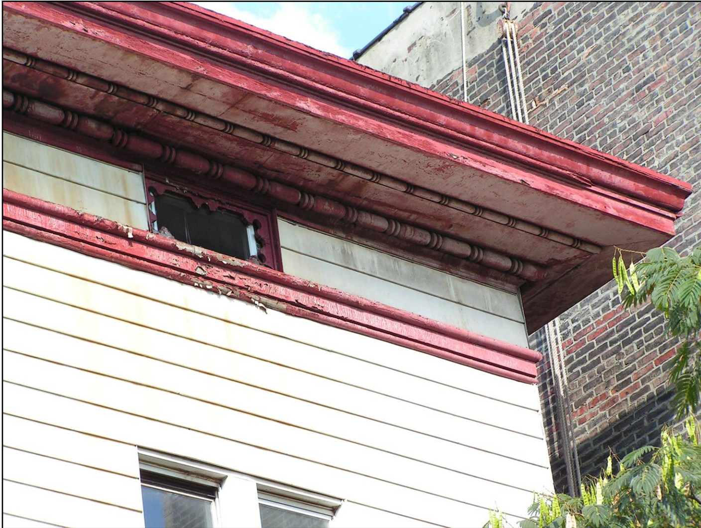
George B. and Susan Elkins House, cornice and attic window details.