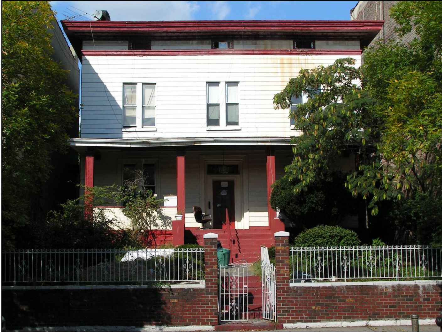
George B. and Susan Elkins House, main (south) façade.