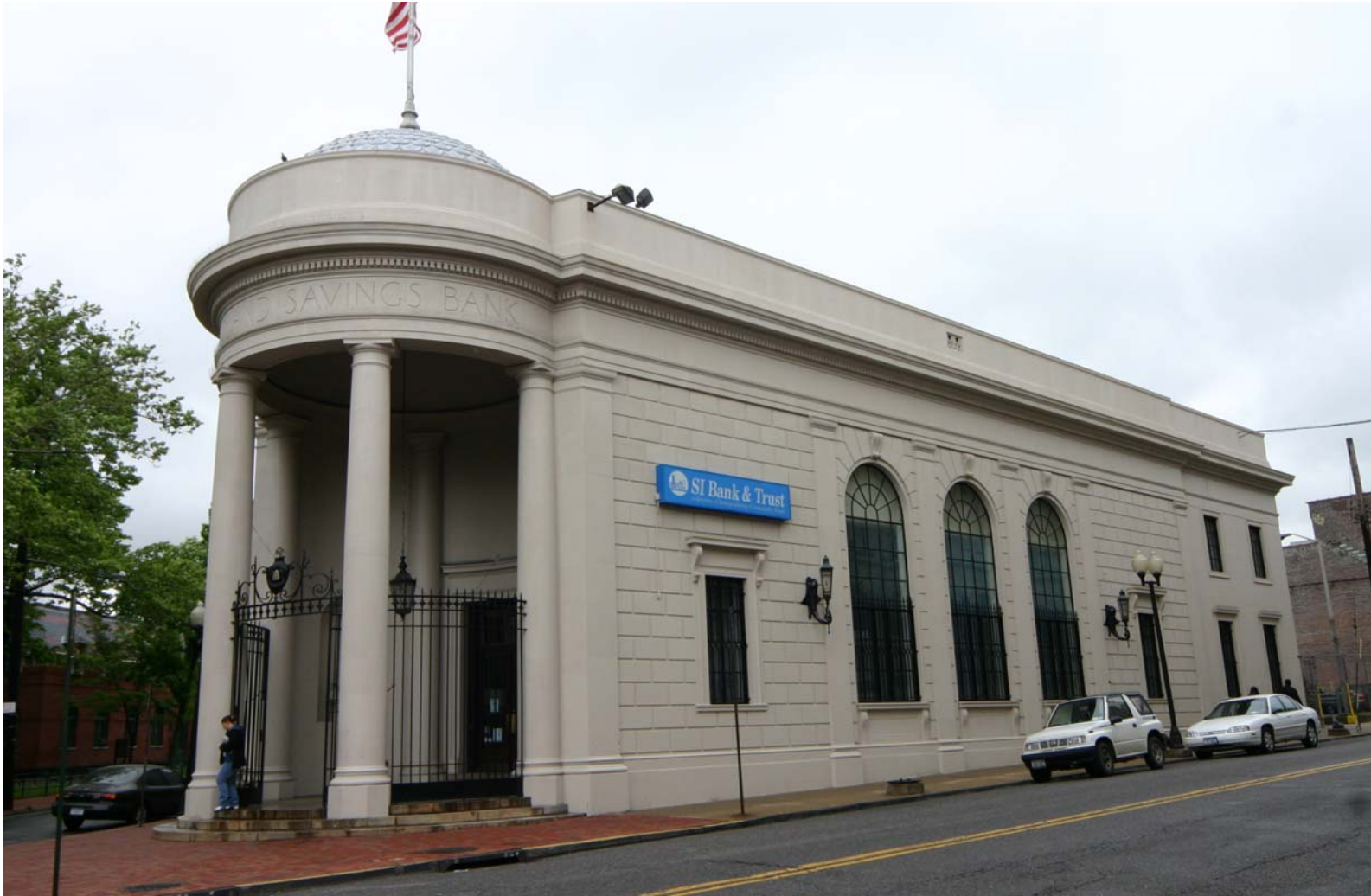
Staten Island Savings Bank Building Beach Street facade