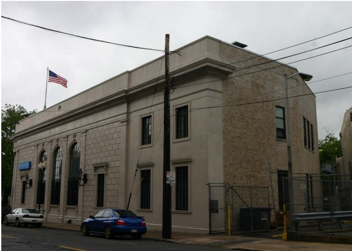
Beach Street and rear facades