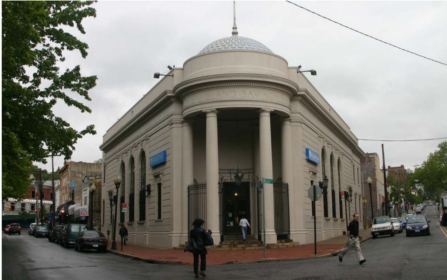
Staten Island Savings Bank Building 81 Water Street Staten Island