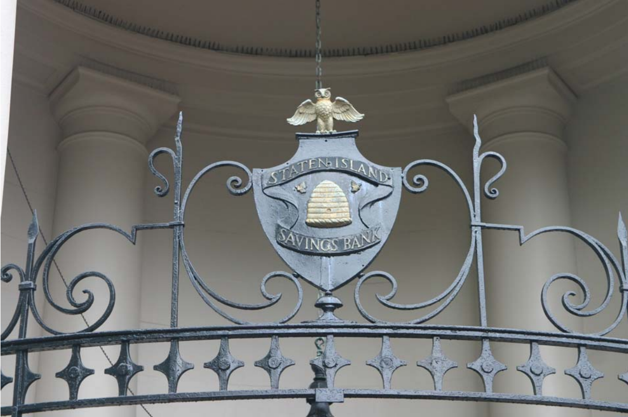
Staten Island Savings Bank Iron work details at entrance