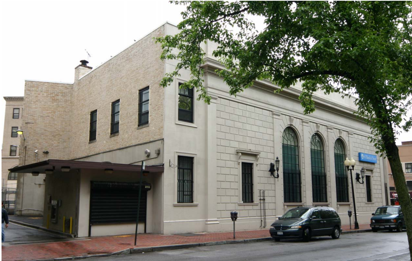
Staten Island Savings Bank Building Water Street and rear facades