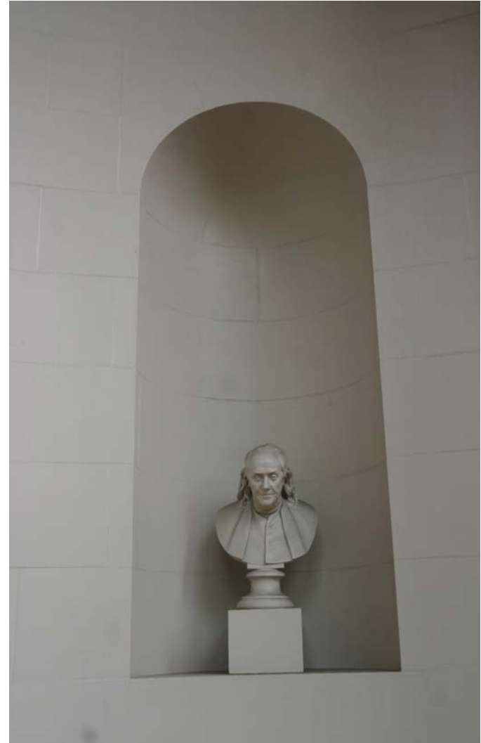
Niche and bust of Benjamin Franklin