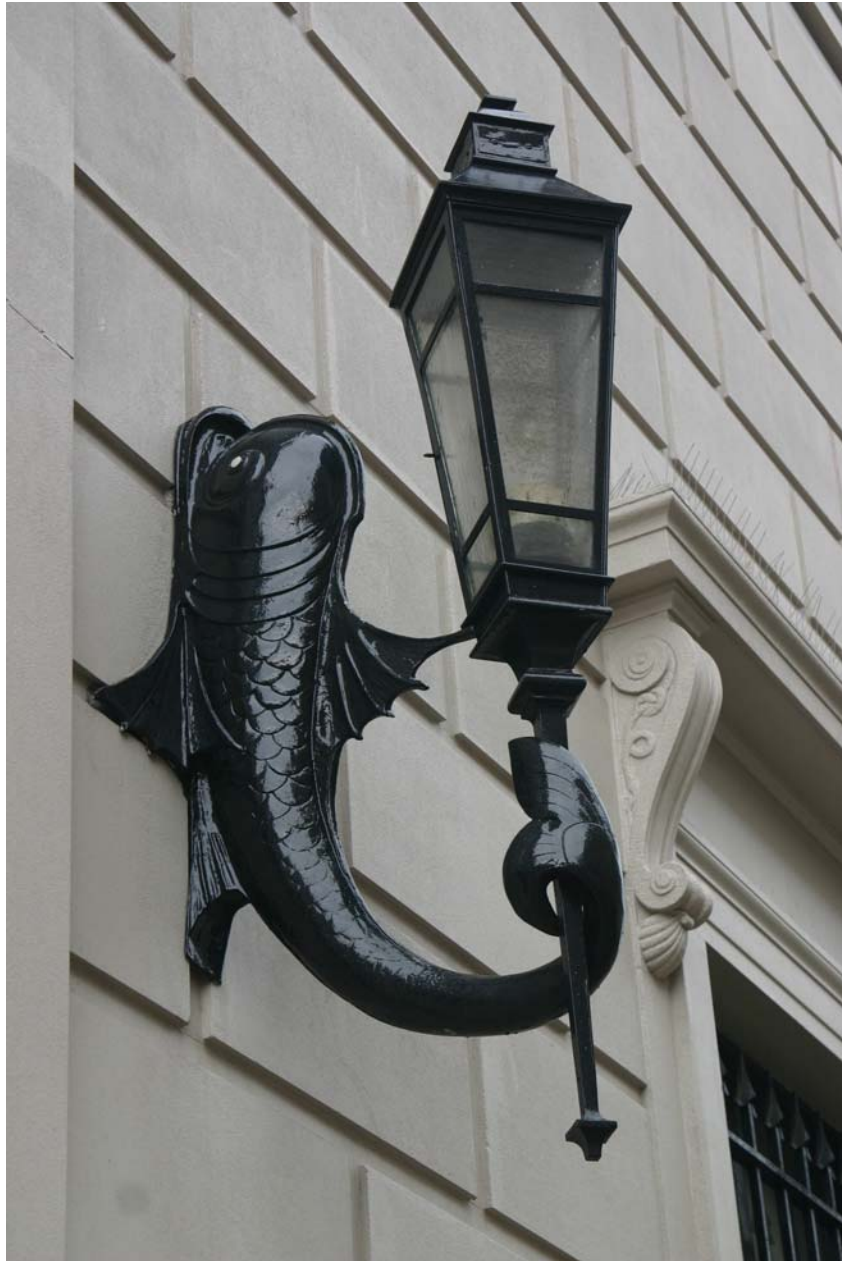
Staten Island Savings Bank Iron work detail