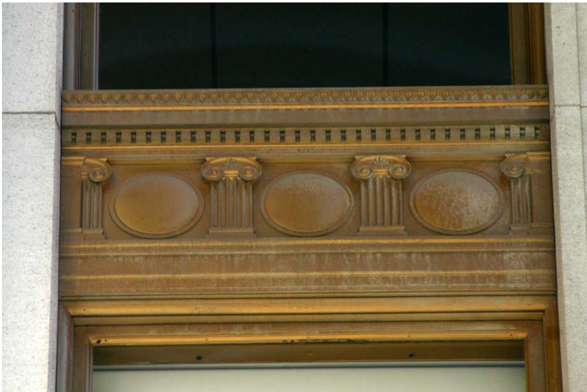
American Telephone & Telegraph Company Building Top: Broadway façade Bottom: Spandrel detail Dey Street façade