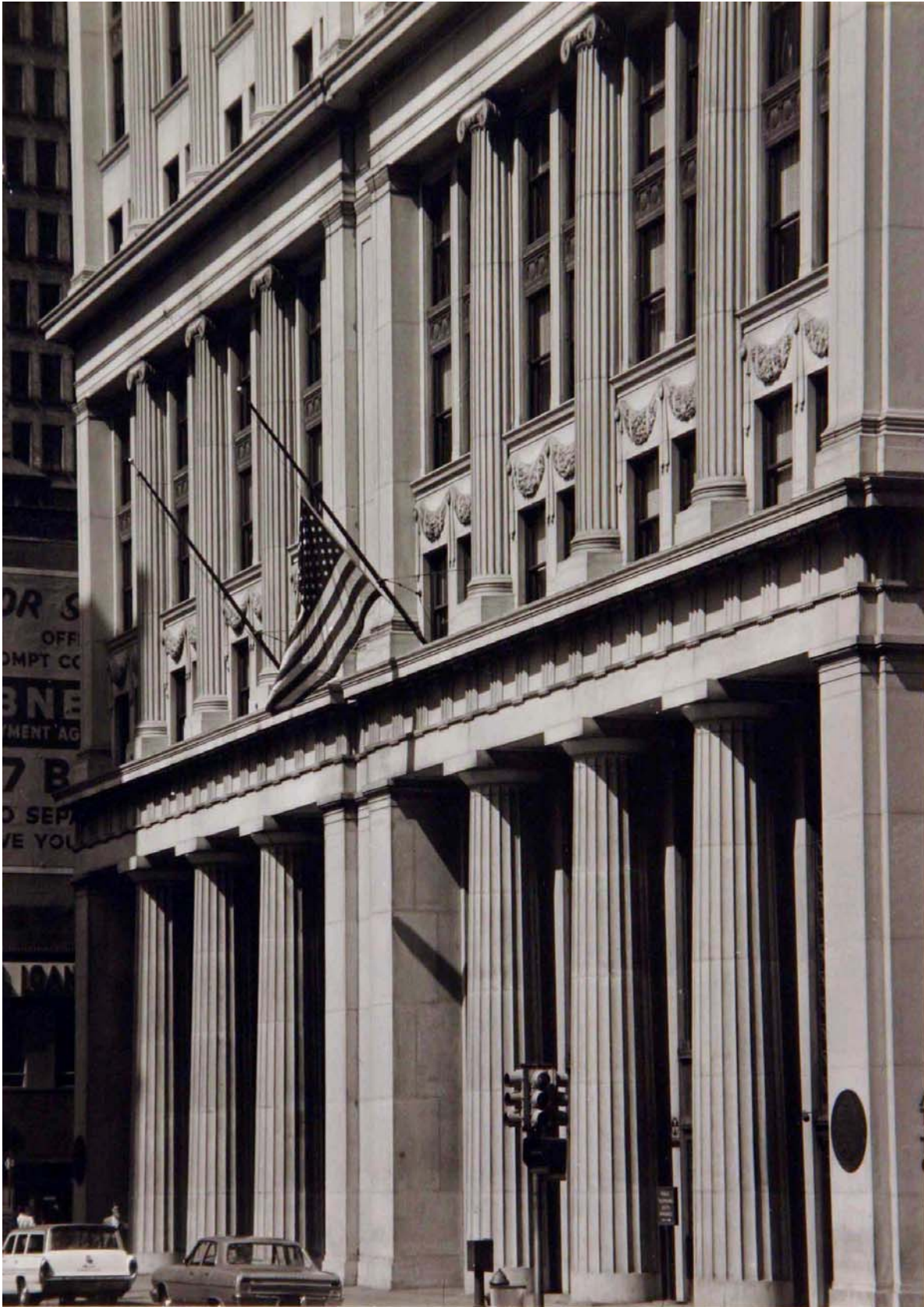
American Telephone & Telegraph Company Building Broadway façade, c. 1962-66