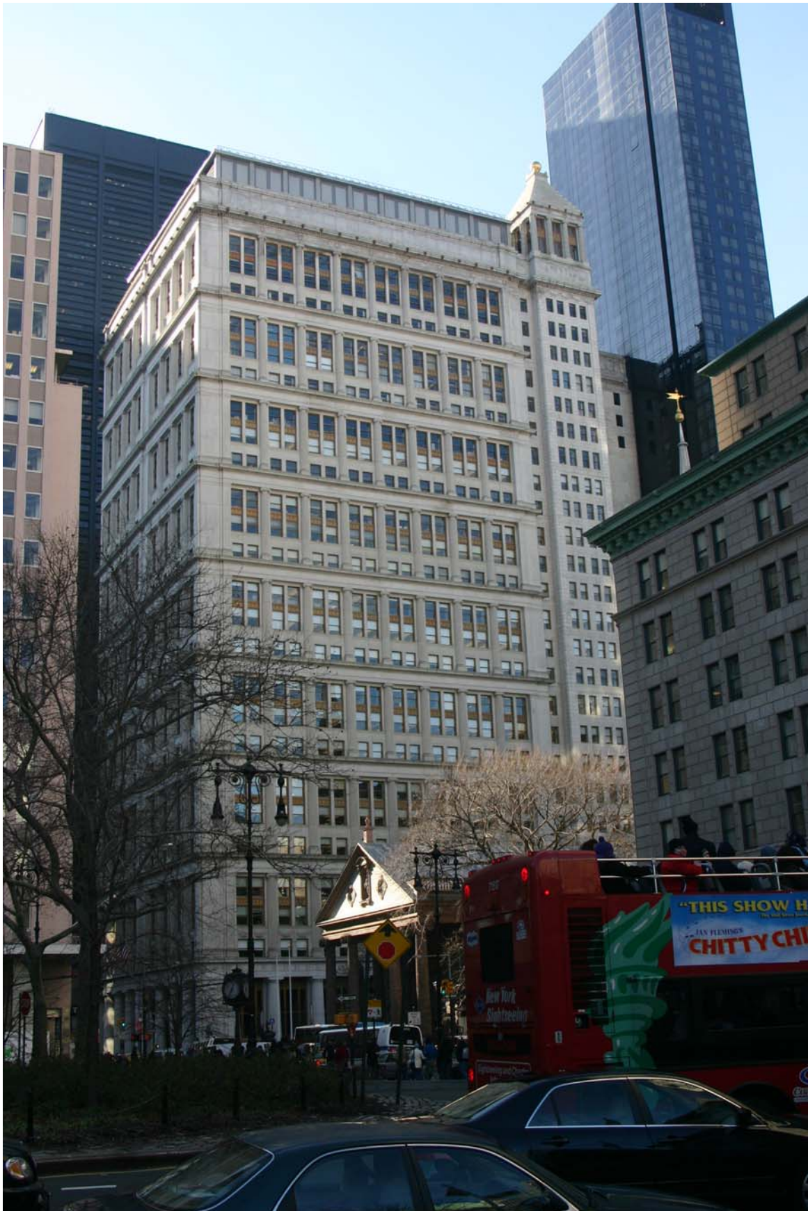
American Telephone & Telegraph Company Building, 195 Broadway (aka 195-207 Broadway, 2-18 Dey Street, 160-170 Fulton Street), Manhattan