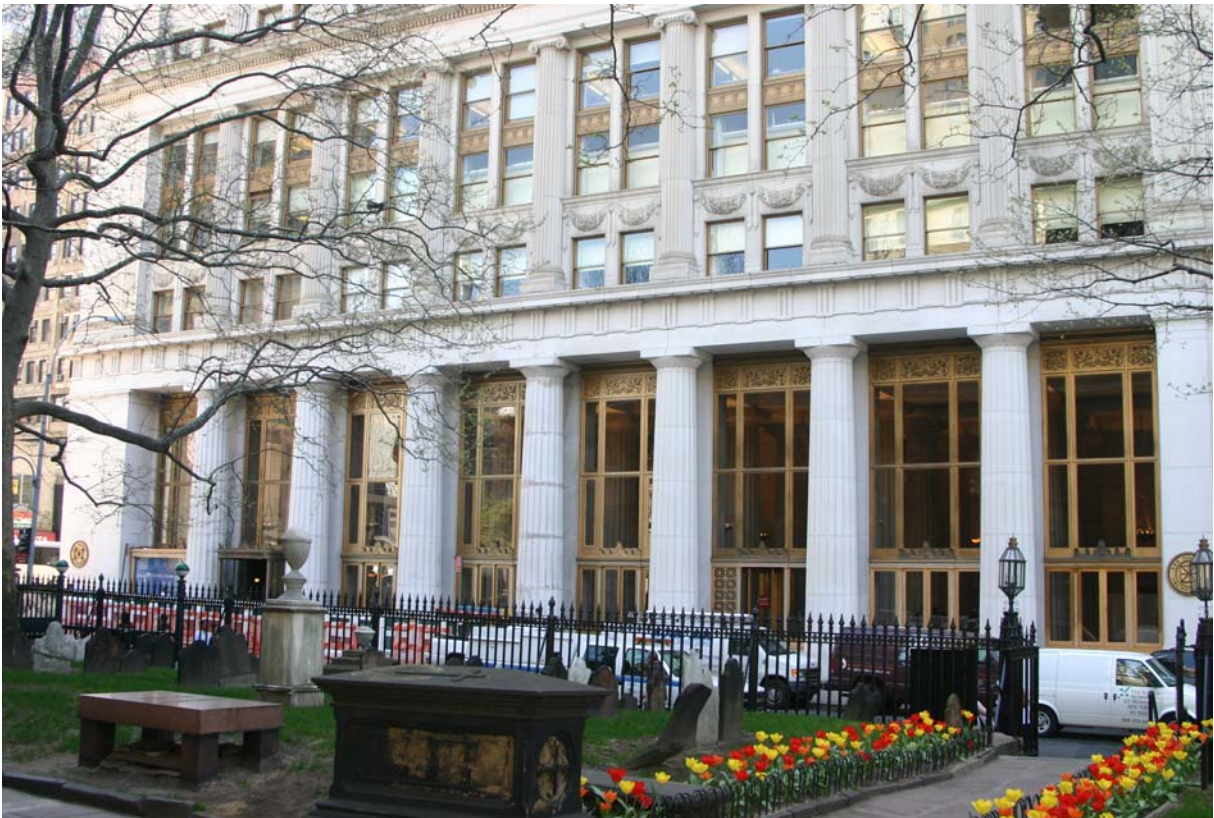
American Telephone & Telegraph Company Building Top: Broadway façade Bottom: Fulton Street façade