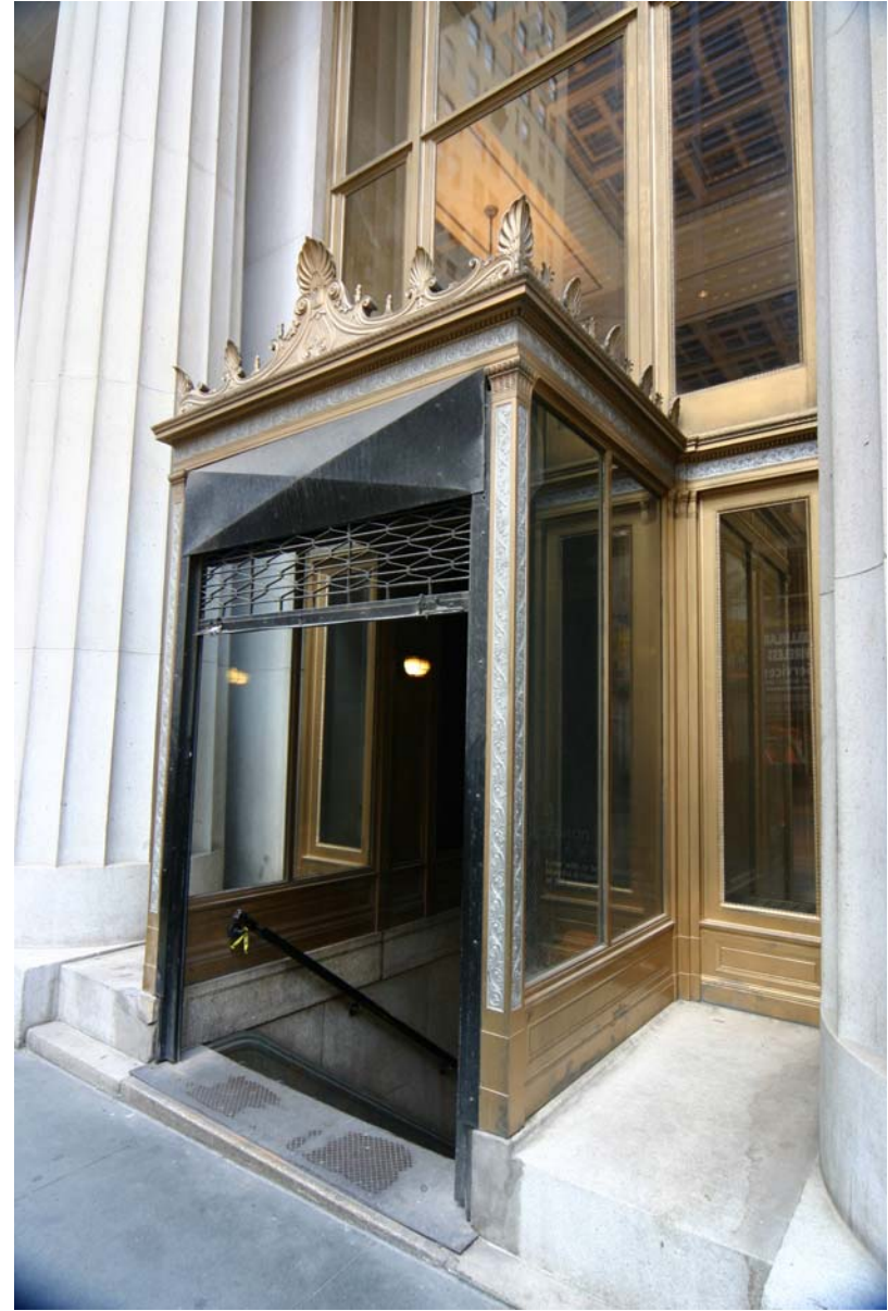
American Telephone & Telegraph Company Building Right: Dey Street subway entrance Left: Fulton Street subway entrance