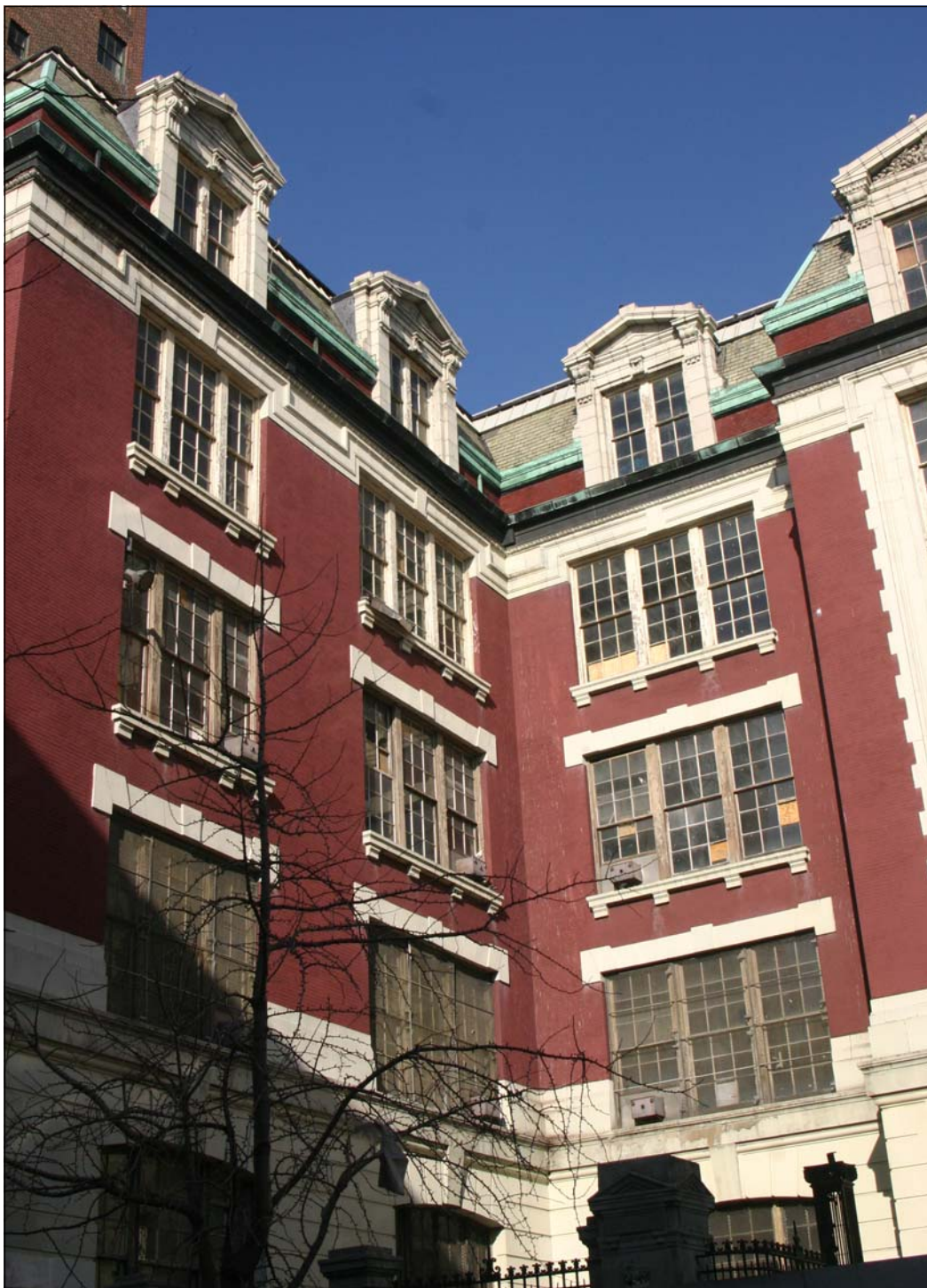
(Former) P.S. 64 East 9th Street Façade