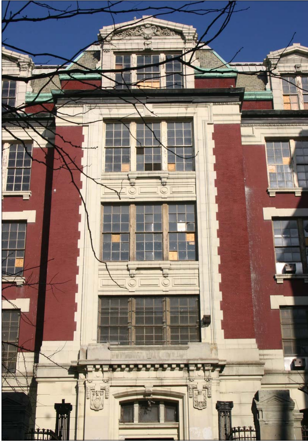
(Former) P.S. 64 East 9th Street Façade