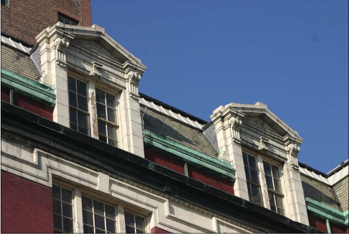
(Former) P.S. 64 East 9th Street Façade Details