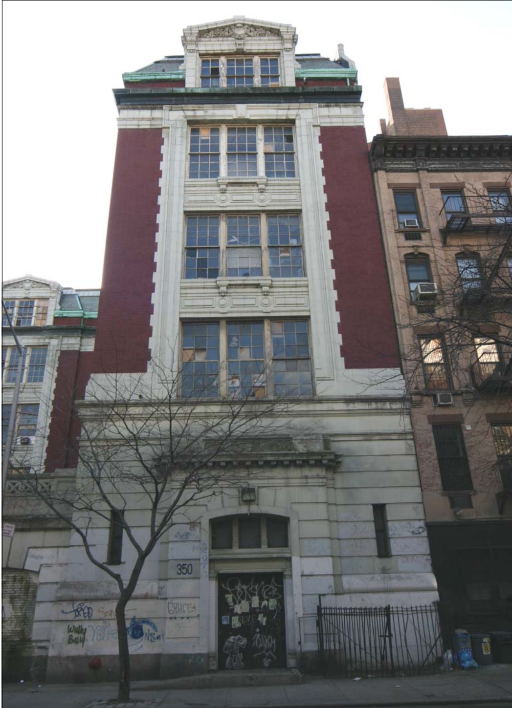
(Former) P.S. 64 East 10th Street Façade