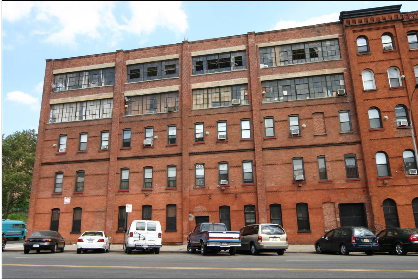
Estey Piano Company Factory, Lincoln Avenue façade, showing the first-floor addition apparently dating from 1895 and later expanded; the second- and third-floor additions dating from 1909; and the fourth- and fifth-floor additions dating from 1919.