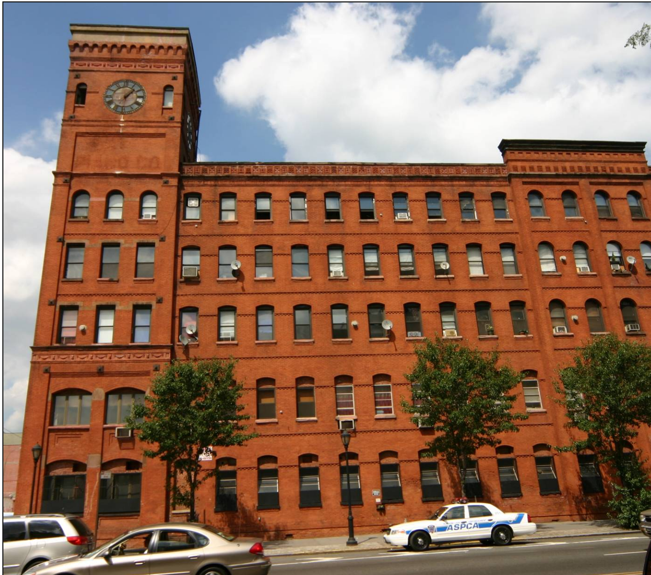
Estey Piano Company Factory, westernmost portion of the Bruckner Boulevard façade. The original, 1885-86 portion of this façade comprises the clock tower, the ten bays immediately to the east of the tower, and the two westernmost bays of the round-arched, four-bay projection.