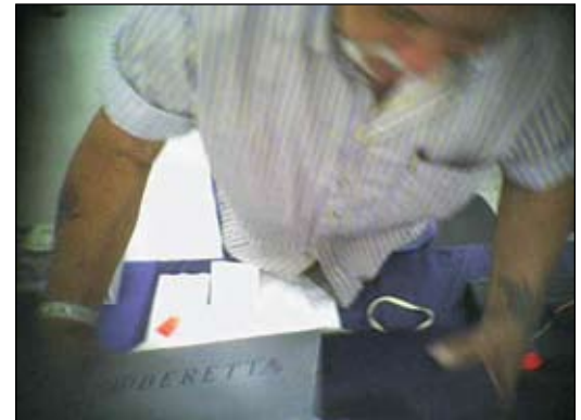
New-in-the-box Beretta sold in Niles, OH

Reno, NV: A private seller said that he was firm on the price of the gun because “it’s brand new.”