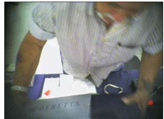
New-in-the-box Beretta sold in Niles, OH

Reno, NV: A private seller said that he was firm on the price of the gun because “it’s brand new.”