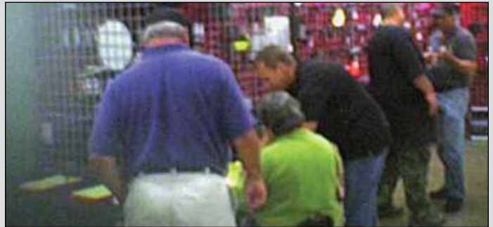
Left to Right: Male Investigator, Female Investigator, and Male Dealer.

MI: Alright. Yeah, I'm going to...My friend over here's to do some paperwork for me.