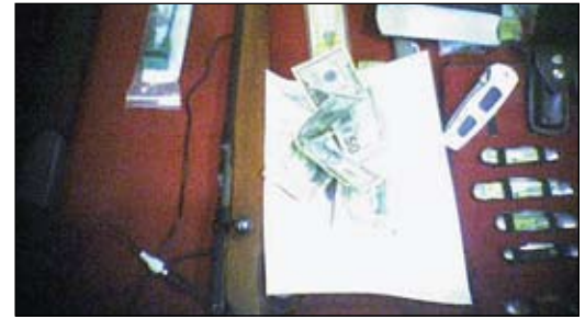
Assault rifle being bought in Sharonville, OH

Smyrna, TN: When an investigator tried to negotiate down the price of a gun, the private seller responded, “I can do a little dealing, but I’ve got to watch. I don’t know what [my partner’s] got in it.”