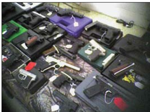
One of four tables from private sellers in Smyrna, TN

It is illegal to “engage in the business” of selling firearms without obtaining a federal firearms license and conducting background checks on buyers. Courts have considered several indicia – selling numerous guns, selling guns regularly, and selling firearms for profit, among others – to determine whether defendants are unlawfully “engaged in the business” and not selling occasionally from a personal firearms collection. Investigators observed many private sellers doing brisk business at gun shows.