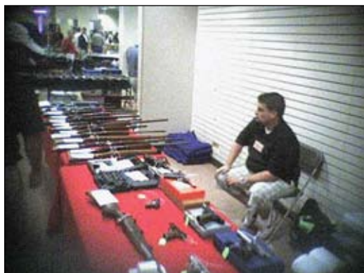
Two of five tables, from long gun seller in Columbus, OH.

Columbus, OH (pictured): A private seller explained that he keeps a lot of long guns in stock because he “does a lot of shows out of state” and can’t sell handguns out of state.