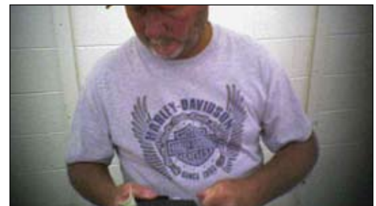
Private seller selling gun he “just bought” in Smyrna, TN

Smyrna, TN (pictured): A private seller was offering a handgun for sale that he had “just bought.” When the investigator said, “Oh, so you’re turning them then today, huh?” the seller responded “I hope to turn one.”