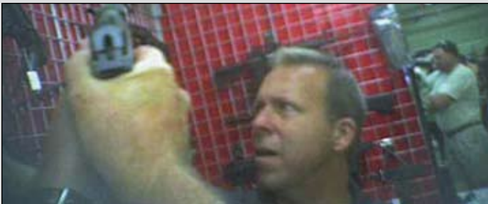
Left to Right: Male Investigator tests a gun and Male Dealer reaches for a second gun.