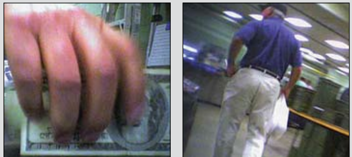
Left: Male Investigators handing over money.