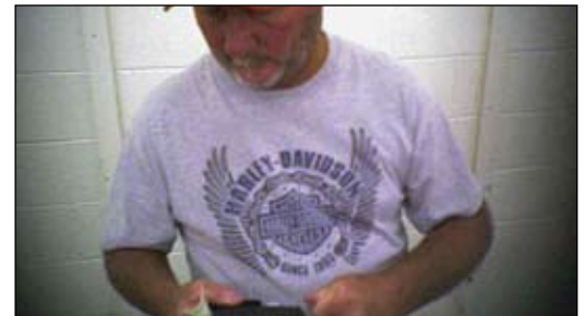
Private seller selling gun he “just bought” in Smyrna, TN

Smyrna, TN (pictured): A private seller was offering a handgun for sale that he had “just bought.” When the investigator said, “Oh, so you’re turning them then today, huh?” the seller responded “I hope to turn one.”