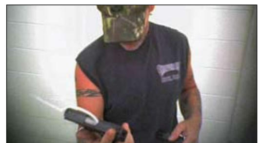
Private seller in Smyrna, TN who explained that he works for another private seller

Sharonville, OH: A private seller told our investigator that “he worked for another guy” who customized the guns for sale. He also said “he’s the dealer...I just work for him.”