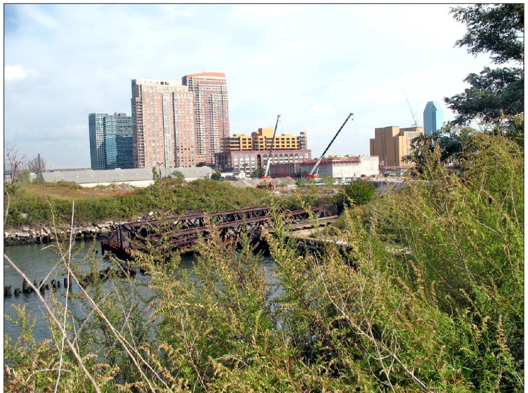
View from south peninsula facing north peninsula and floating bridge 10