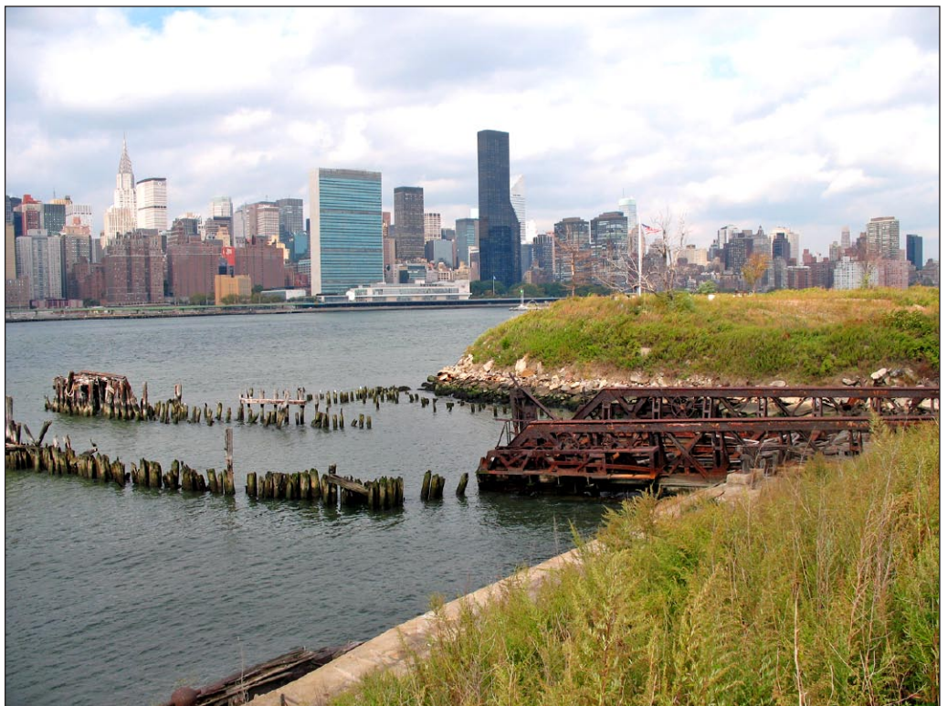
View of north peninsula and the floating bridge 8