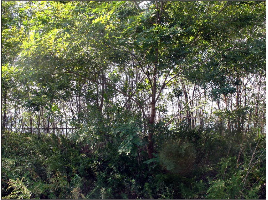
North point of south peninsula 11