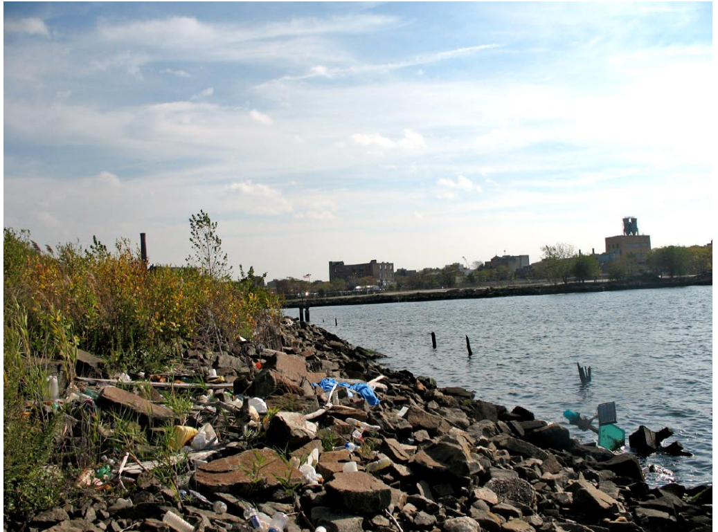
Shoreline of Newtown Creek from south peninsula point facing east 15