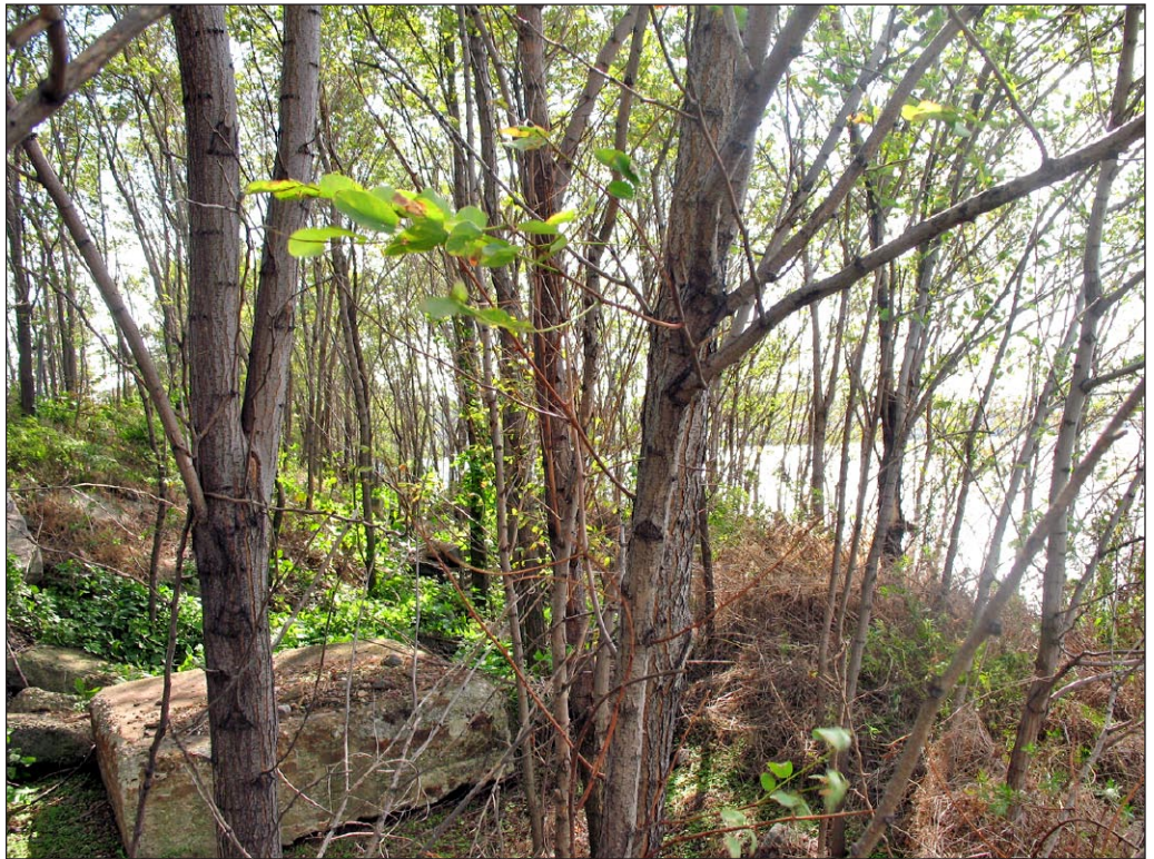
Black locust trees on south peninsula facing Newtown Creek 12