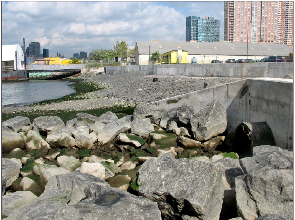
Facing north at beach area and sewer outfall to water taxi landing (low tide) 2