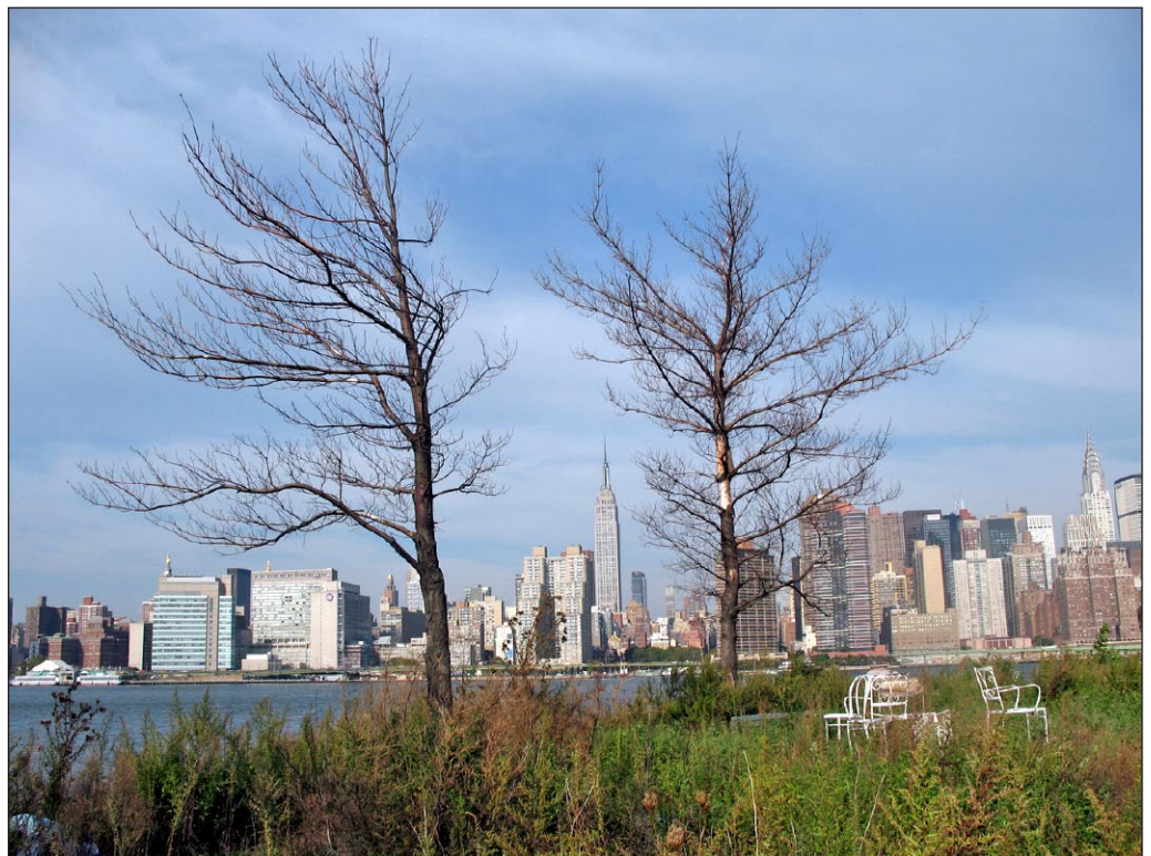
Facing west on north peninsula 6