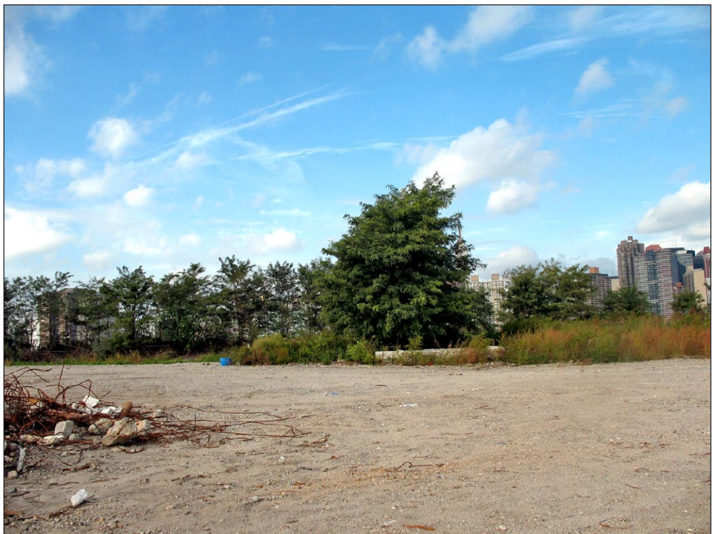
South peninsula facing southwest 18