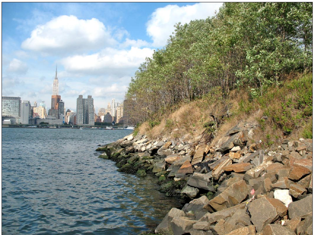
View of black locust trees on south peninsula point on Newtown Creek facing west 14