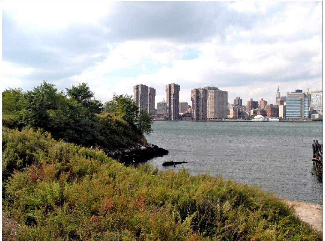
View of the south peninsula from the floating bridge cove area facing west 9