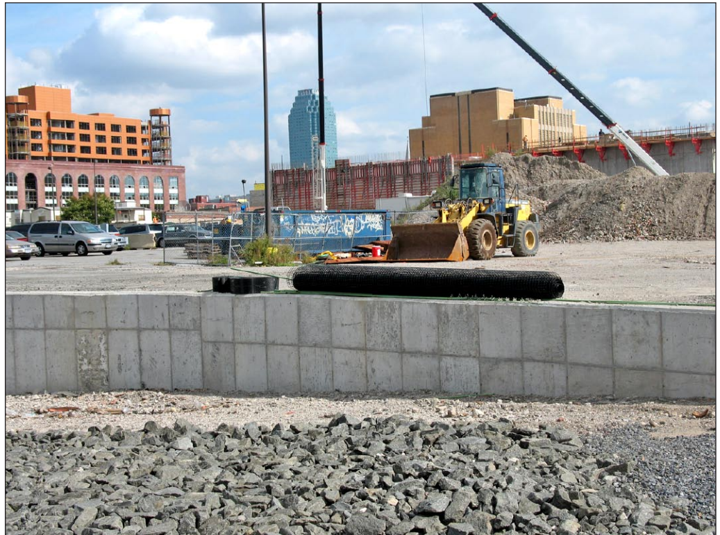
Facing east from beach area (low tide) 3