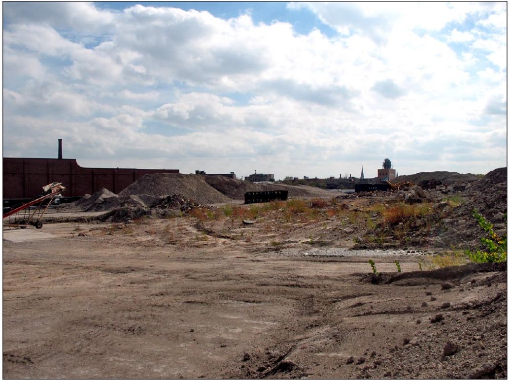
South peninsula interior facing southeast toward Newtown Creek 19