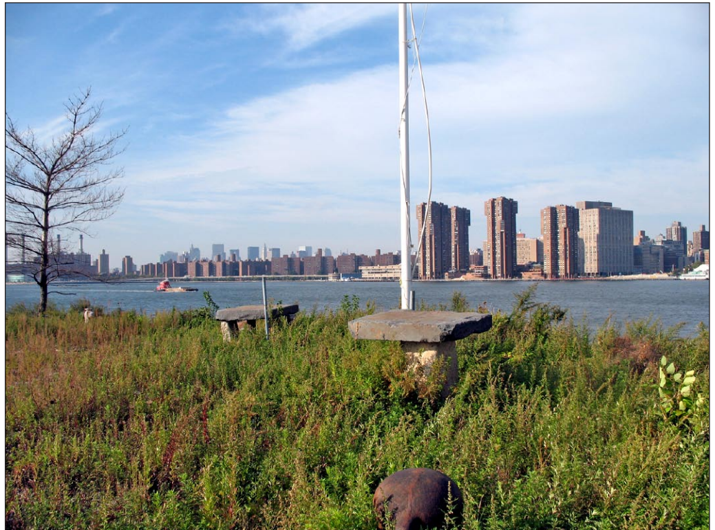
Facing southwest on north peninsula 5