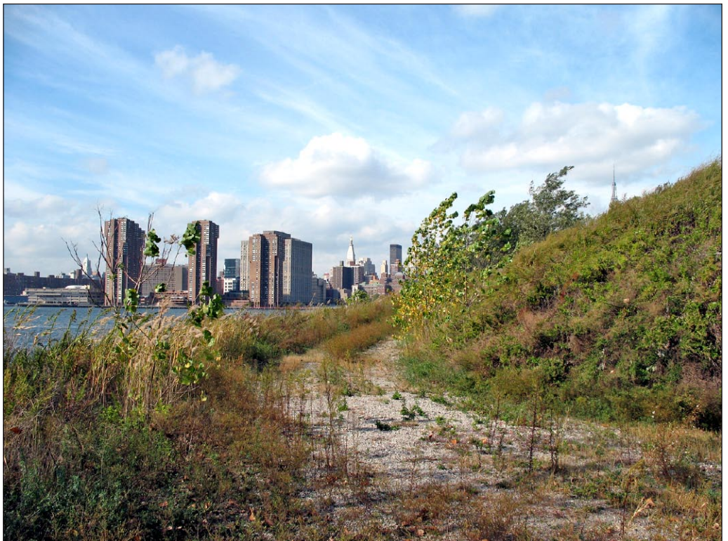
Along Newtown Creek facing west from the area near Anheuser-Busch Facility 16