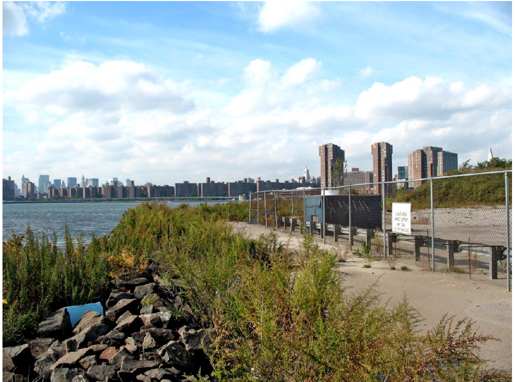
Facing west on Newtown Creek next to Anheuser-Busch Facility 17