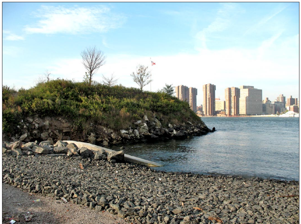
View of north peninsula and beach area facing southwest (high tide) 4