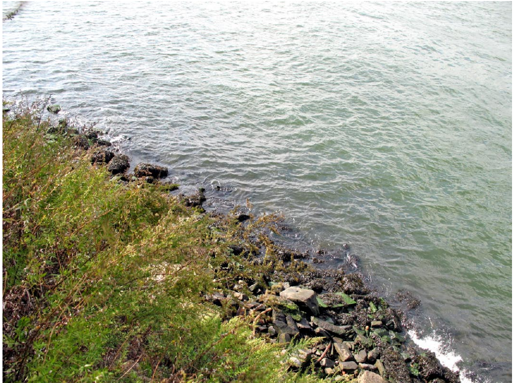
Shoreline of south peninsula point facing Newtown Creek 13