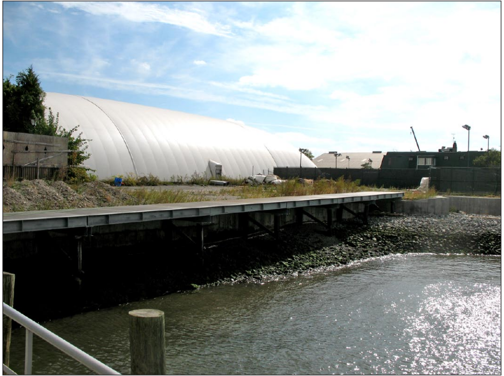
Facing south at tennis facility 1