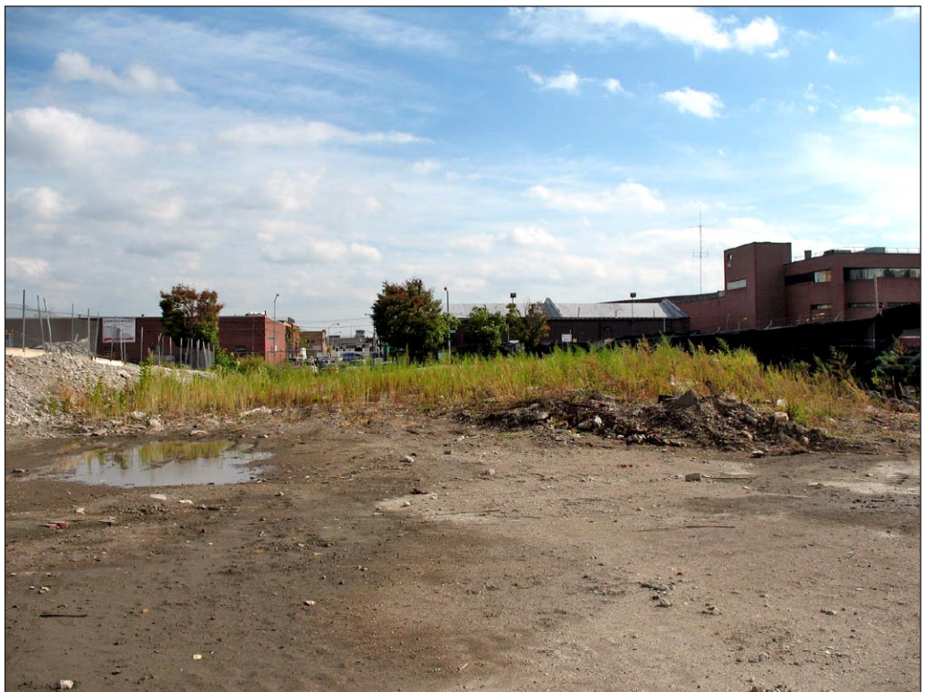
Interior of Site A facing east to 54th Avenue 20