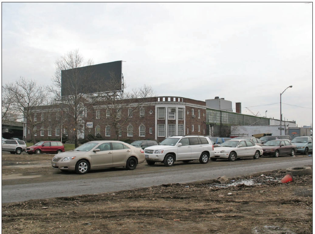
Former Empire Millwork Corporation Building, view southeast 2