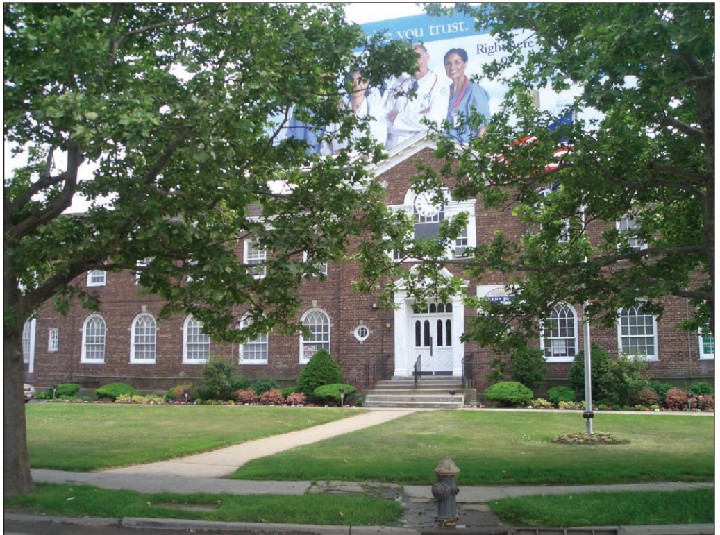
Former Empire Millwork Corporation Building, front facade 1