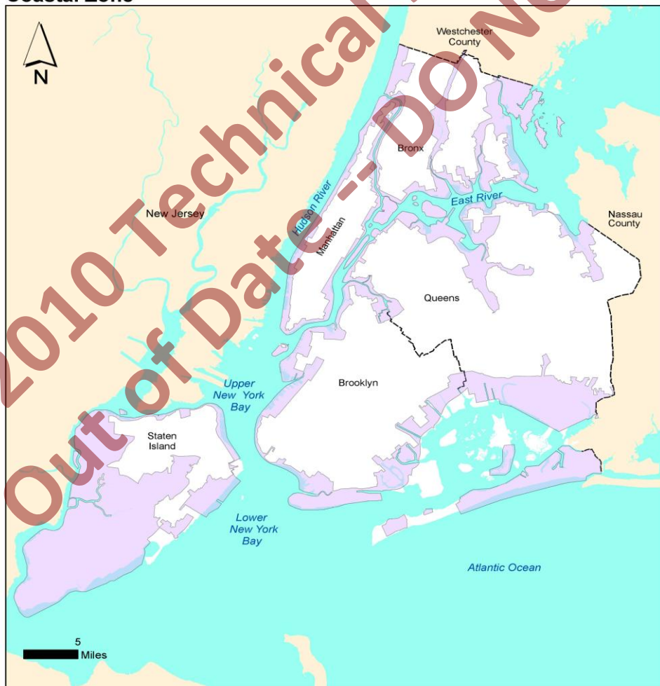
Figure 4-3 Coastal Zone

COASTAL ZONE. New York City's WRP establishes Coastal Zone boundaries (Figure 4-3), within which all discretionary actions must be reviewed for consistency with Coastal Zone policies. The Coastal Zone, which is mapped in the City's Coastal Zone Boundaries maps, is the geographic area of New York City's coastal waters and adjacent shorelands that have a direct and significant effect on coastal waters. It generally extends landward from the pierhead line or property line (whichever is furthest seaward) to include coastal resources and upland, usually at least to the first mapped street. The Coastal Zone includes islands, tidal wetlands, beaches, dunes, barrier islands, cliffs, bluffs, intertidal estuaries, flooding and erosion-prone areas, port facilities, vital built features (such as historic resources), and other coastal locations. The Coastal Zone should not be confused with the more limited areas of "waterfront blocks" or "waterfront lots" --terms defined in Article VI, Chapter 2 of the NYC Zoning Resolution.