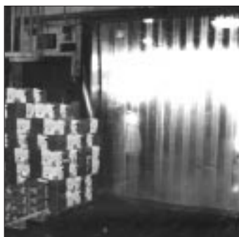
Vinyl strips offer an inexpensive way to reduce energy costs.

NYC WasteLeSS partners Blue Ridge Farms, Inc., The Jacob K. Javits Convention Center and many of the produce wholesalers at the Hunts Point Terminal Produce Market have installed vinyl strips on doors leading to loading docks and refrigerated units. ■