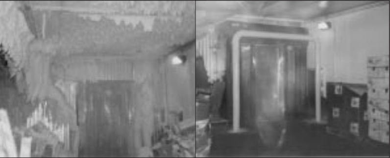
Before (l.) and after (r.) installation of a desiccant dehumidification system in a frozen warehouse.

“It’s not the heat; it’s the humidity.” — a common sentiment in New York City during the summer months. Besides making us all uncomfortable, high humidity levels may affect the efficiency of air conditioning and refrigeration systems and contribute to poor indoor