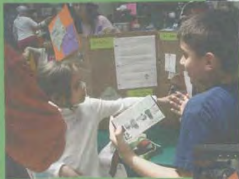
At the Ecology Day Fair explaining how we turned "Trash to Treasure."