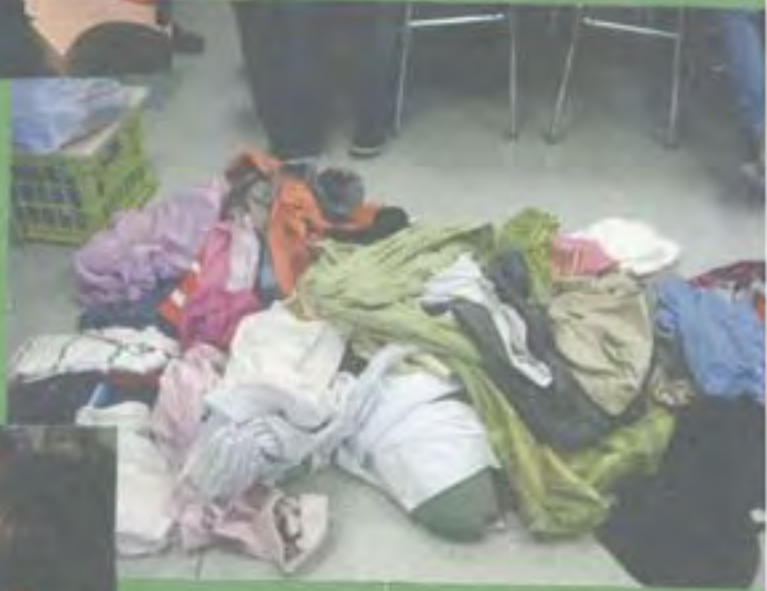
First collection 70 shirts, 30 lbs. that they took with them.