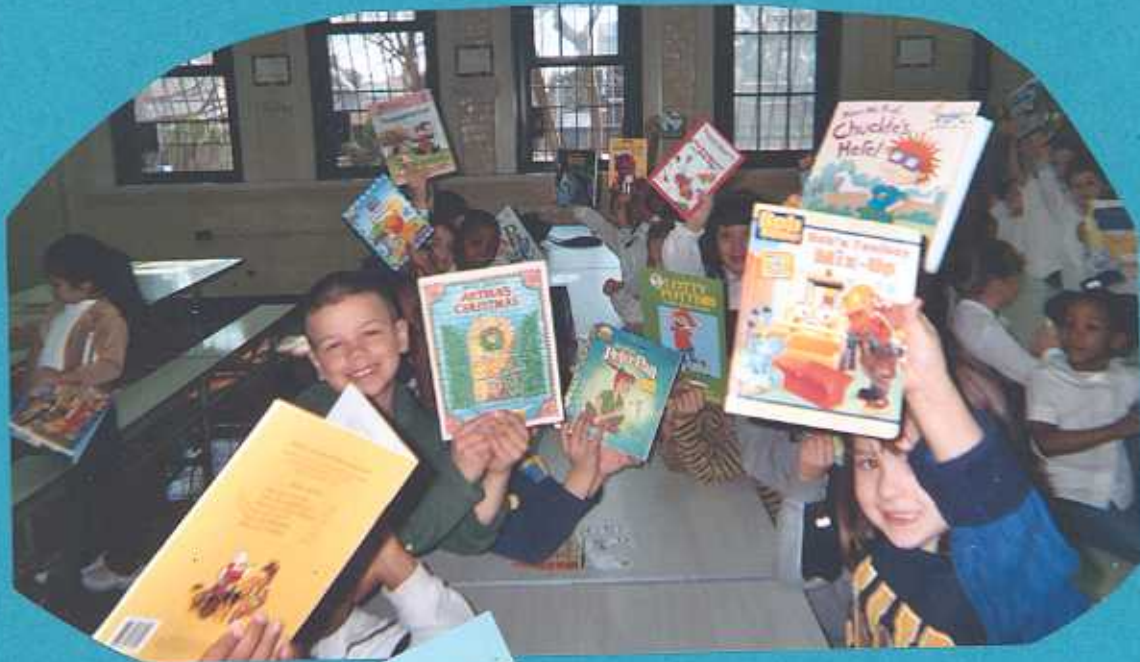
Kindergarten children showing off their new books received at the book swap.