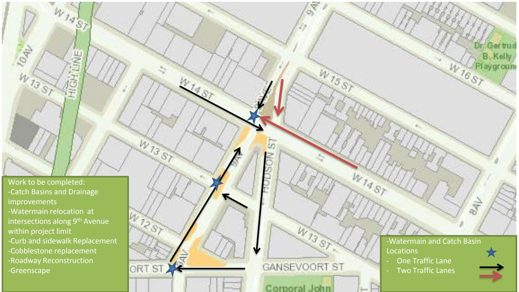
9 th Avenue/Gansevoort Area construction traffic pattern