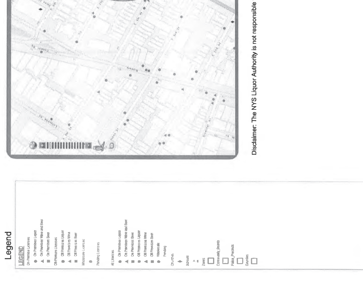
Disclaimer. The NYS Liquor Authority is not responsible for the accuracy of maps or data obtained from third party sources.