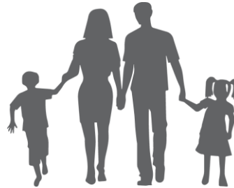
Average Household Size (1.94)