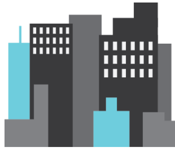
New Residential Units Built or Expected*