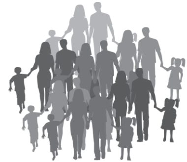
Projected Population Increase

*Note: Built and expected residential units counts are only approximation. Final numbers may vary. Residential units count compiled from news sources and the NYC DOT Construction Project List.