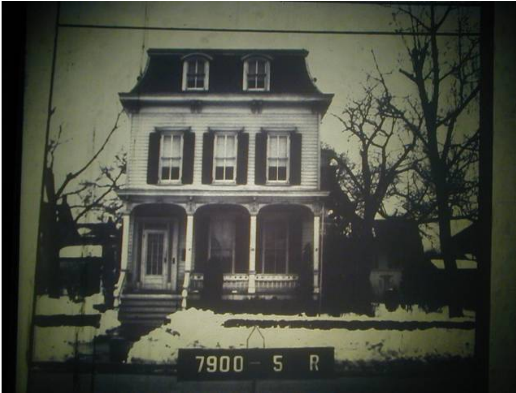
James L. and Lucinda Bedell House, 7484 Amboy Road, Staten Island, c. 1940