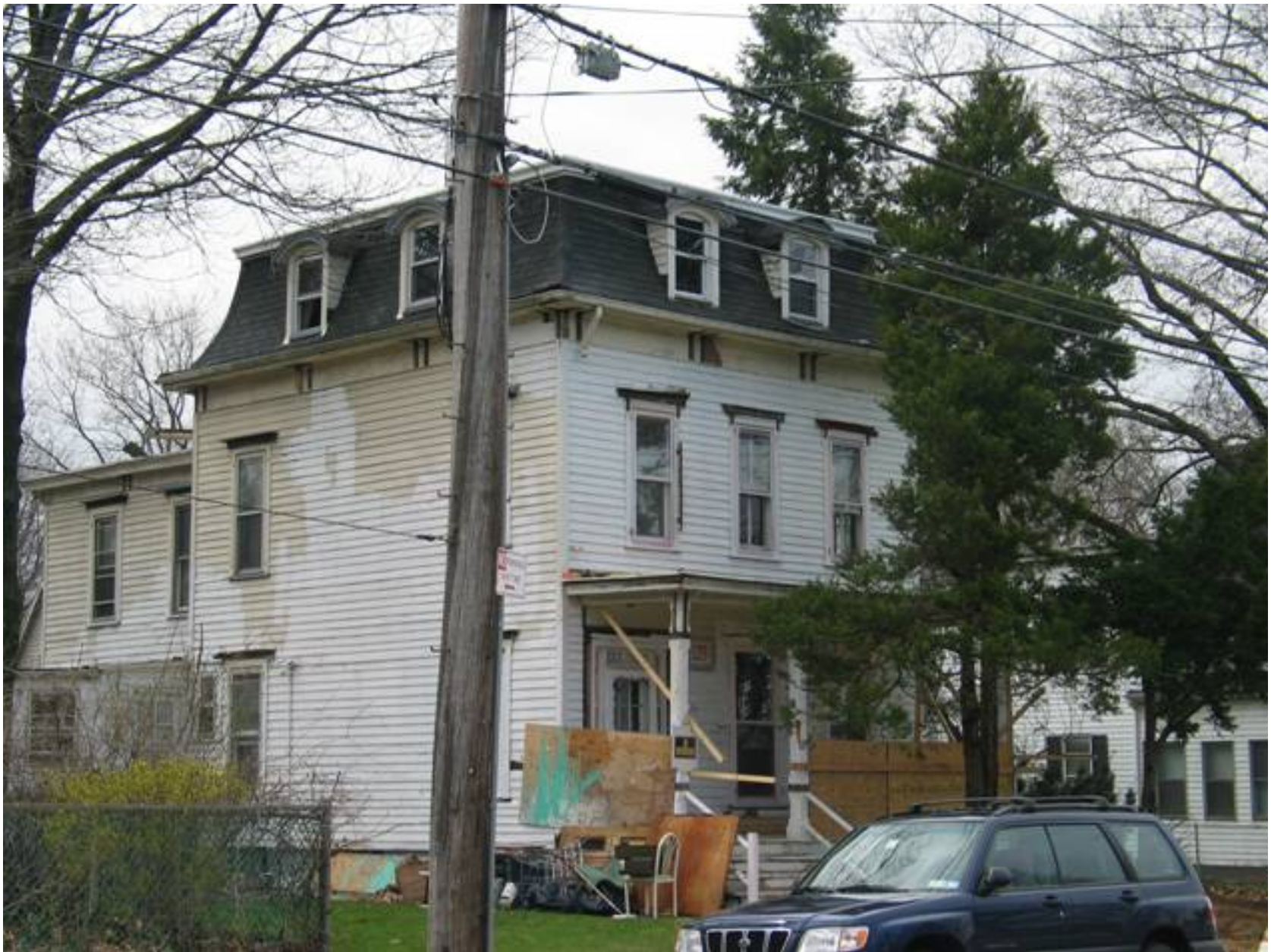
James L. and Lucinda Bedell House, 7484 Amboy Road, Staten Island, April 2005