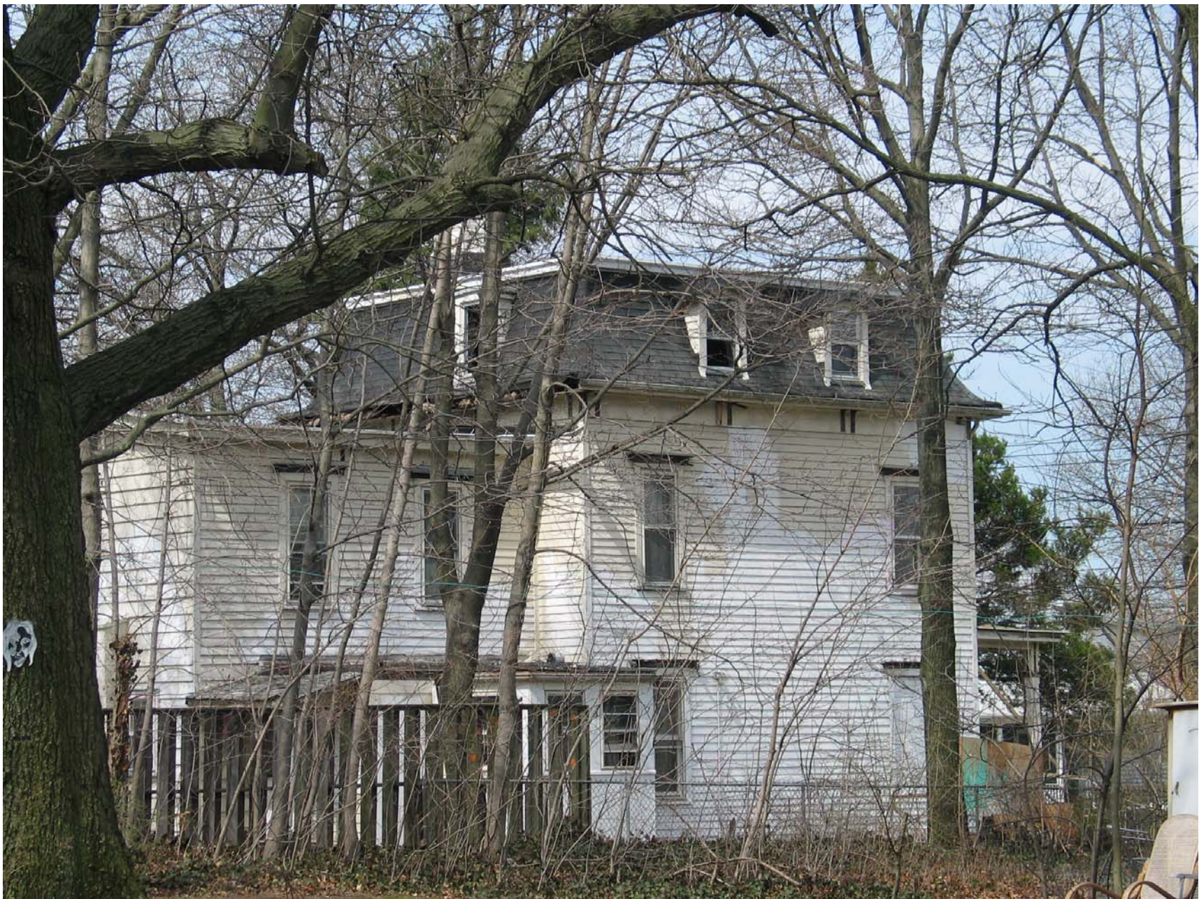
James L. and Lucinda Bedell House, 7484 Amboy Road, Staten Island, April 2005