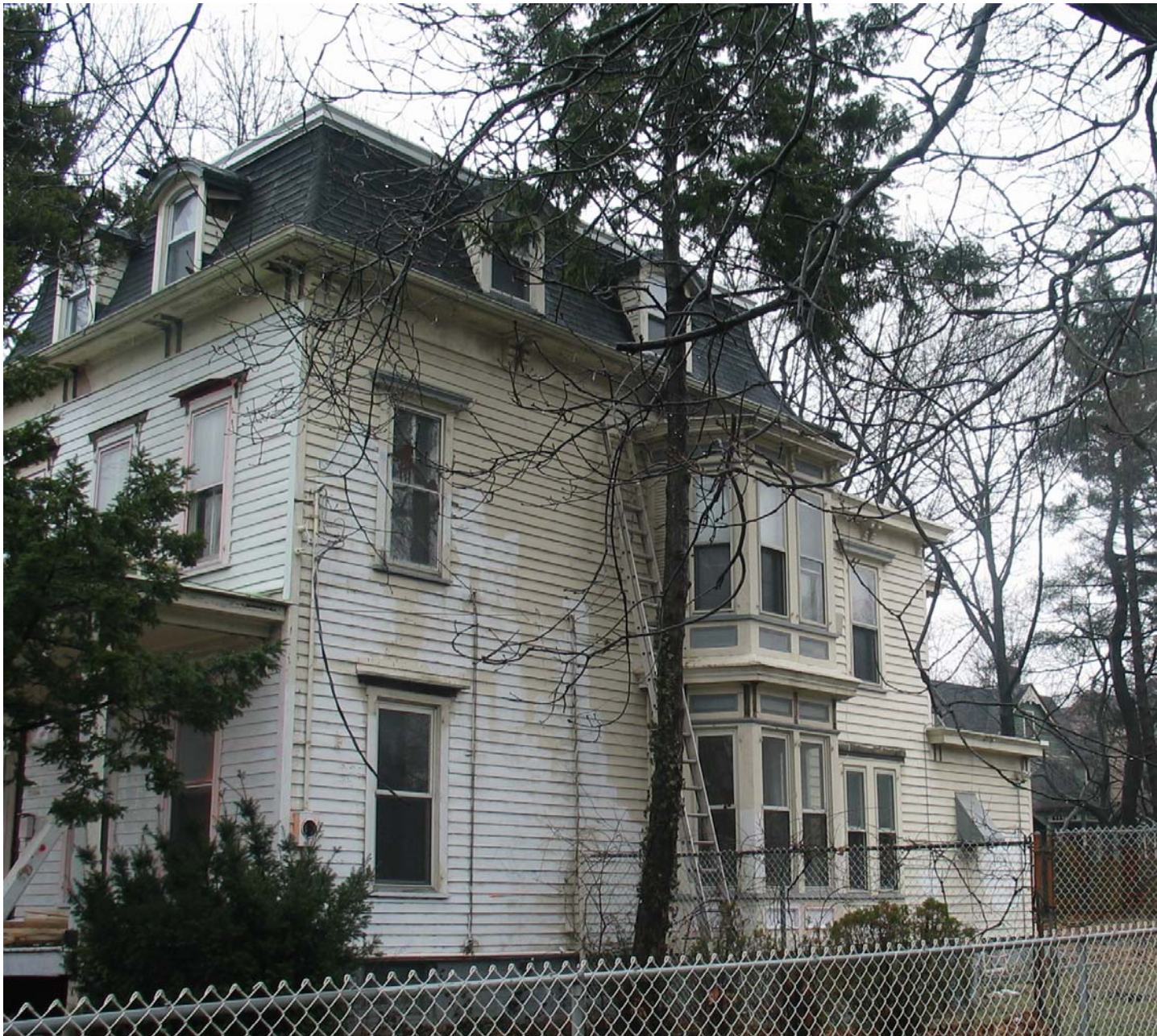
James L. and Lucinda Bedell House, 7484 Amboy Road, Staten Island, March 2005