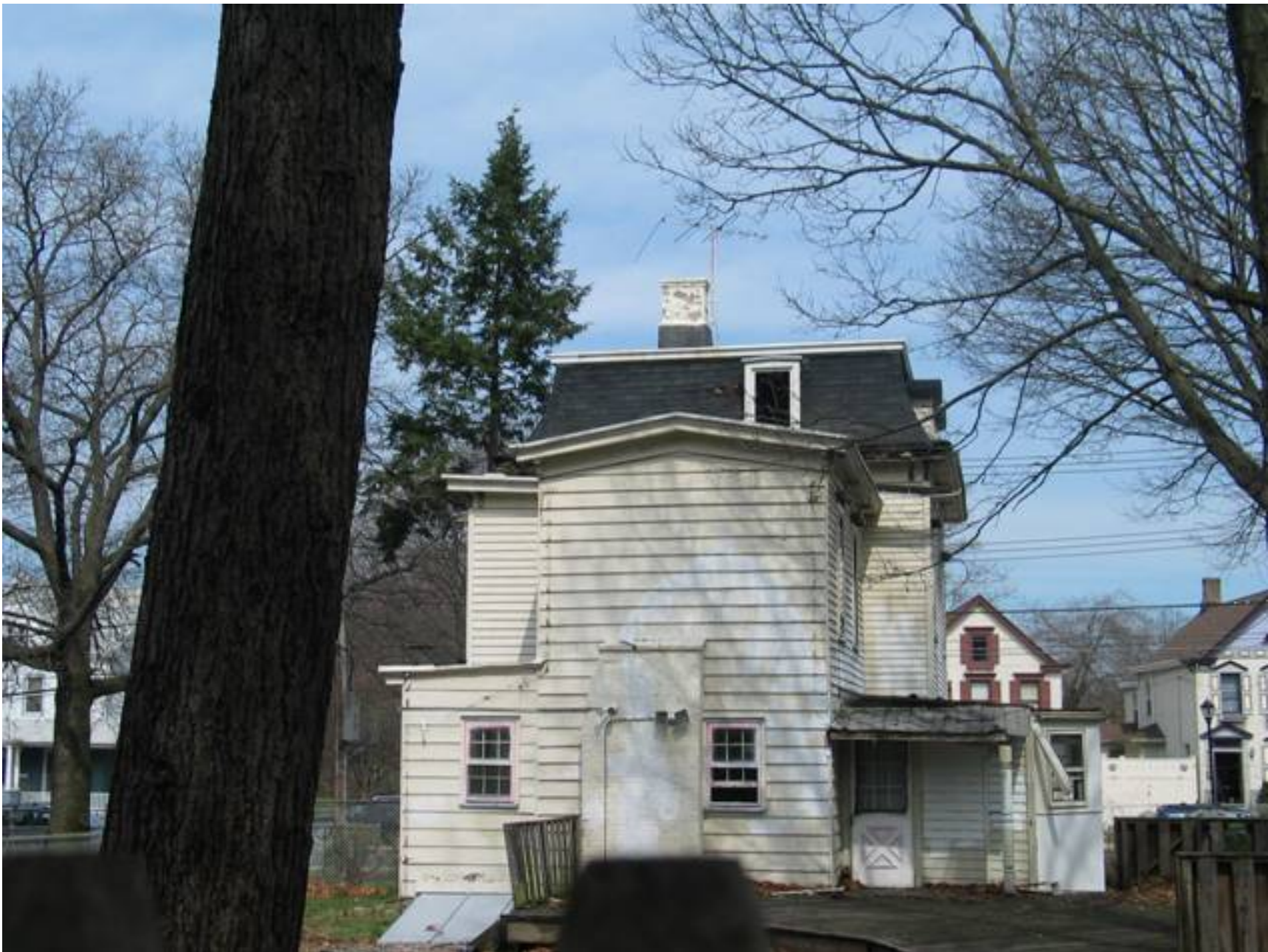
James L. and Lucinda Bedell House, 7484 Amboy Road, Staten Island, April 2005