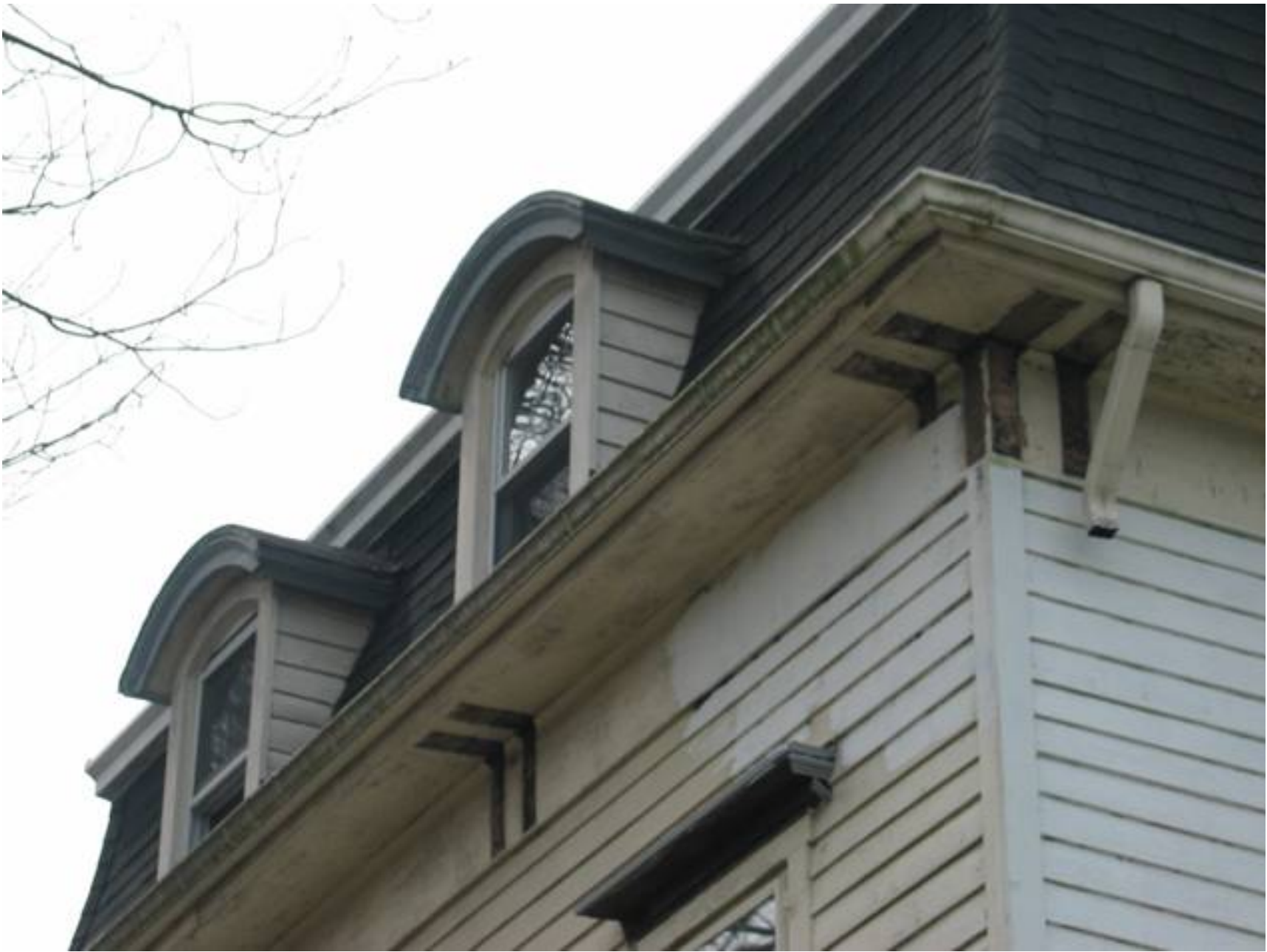
James L. and Lucinda Bedell House, 7484 Amboy Road, Staten Island, April 2005