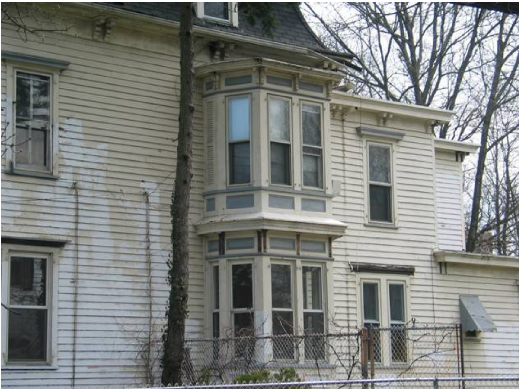
James L. and Lucinda Bedell House, 7484 Amboy Road, Staten Island, April 2005