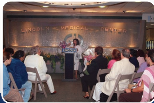
First Saturday in October lecture at Lincoln Hospital

The Network's Community Outreach and Health Education Departments surpassed their efforts to promote healthier lifestyles. In every one of our facilities, the TAKE CARE NY month-long campaign became a top priority during October 2008. The campaign urges New Yorkers of all ages to protect their health through screenings for blood pressure, cancer, asthma, diabetes, HIV and other diseases. Our community outreach and education teams held numerous screening events, seminars, health fairs and other health awareness activities. Lincoln was at the top of the list of acute care facilities with the highest number of people attending the Take Care NY events. Morrisania was in front of other Neighborhood Family Health Centers in attendance and screenings with Belvis coming in second place at the Annual "Making Strides Against Breast Cancer" Walk. Harlem Hospital and Renaissance Health Care Network were the largest team in the Corporation, bringing over 80 participants to Central Park.