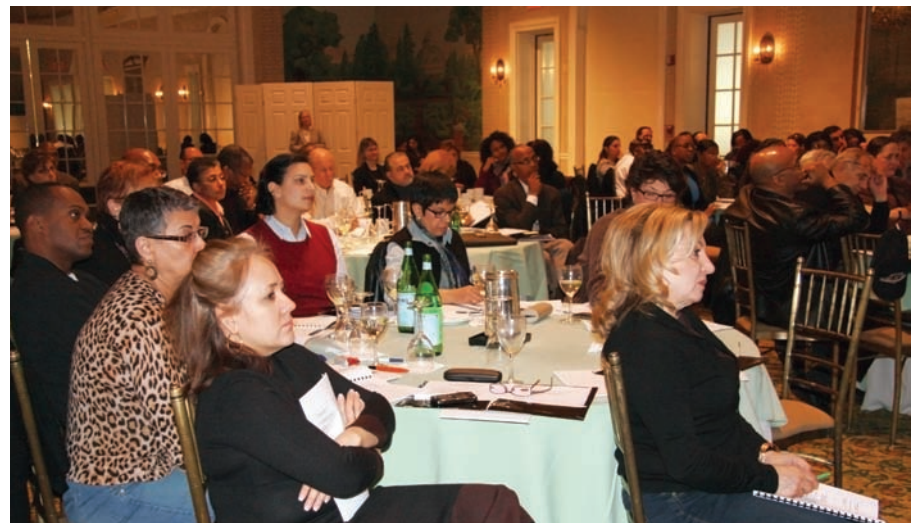
Over 80 clinical and administrative staff attended the seminar