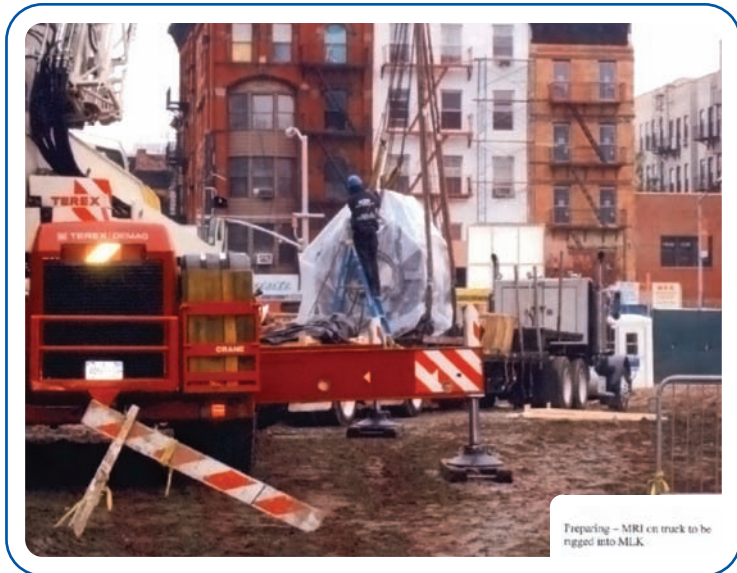
Workmen preparing MRI on the truck to be lifted by crane to the fifth floor

To accommodate the new equipment, over the past few months, many services were relocated, including the Birth Certificate Office and Breast Feeding Services. Demolition began with the removal of the concrete slab and structural steel. The flooring system was strengthened to support the weight of the MRI. In November, the new MRI unit was delivered and rigged into place through a huge hole made in the outside wall of the MLK Pavilion. The hole has since been closed up and the contractor continues to work on completing all phases of the project in time for the in-service date. When the Modernization Project is completed, Harlem Hospital Center will be one of the most technologically advanced hospitals, public or private, in New York City.