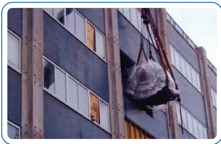
MRI being rigged into the MLK Pavilion fifth floor at Harlem Hospital Center