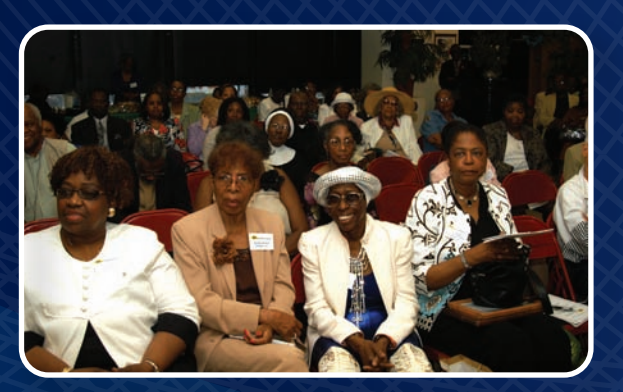
Attendees, 2009 RHCN Auxiliary Annual Public Meeting