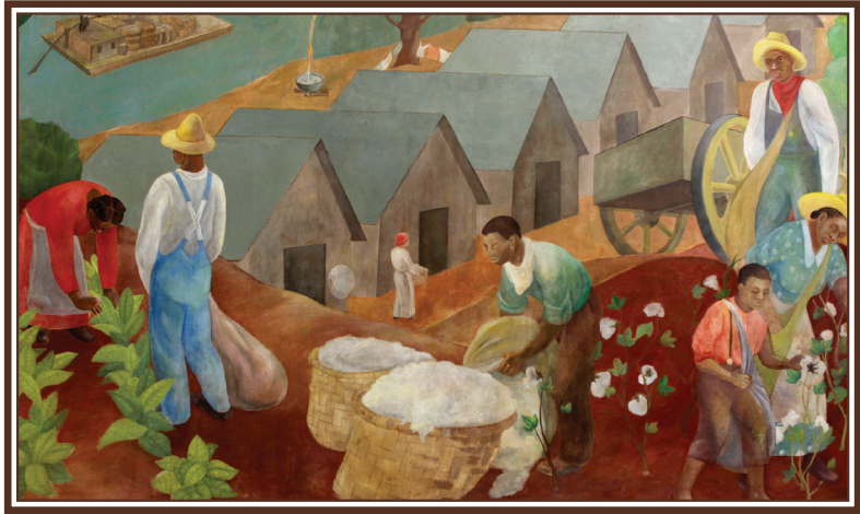
Pursuit of Happiness - (1937) Vertis Hayes