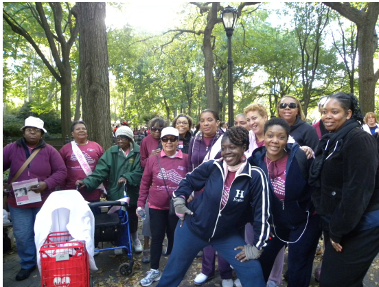
Making Strides Walking Team 2012

Harlem Hospital - Generations+/Northern Manhattan Network November 25, 2011-----