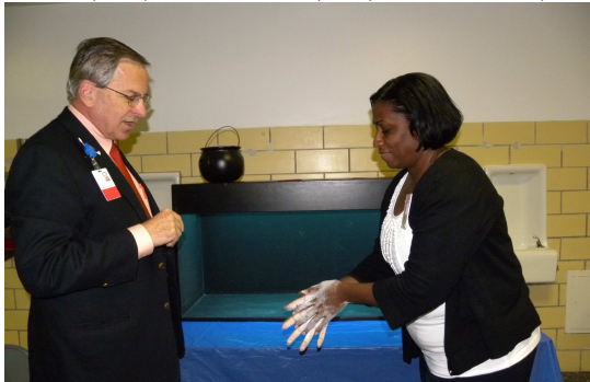
Hand washing techniques demonstrated