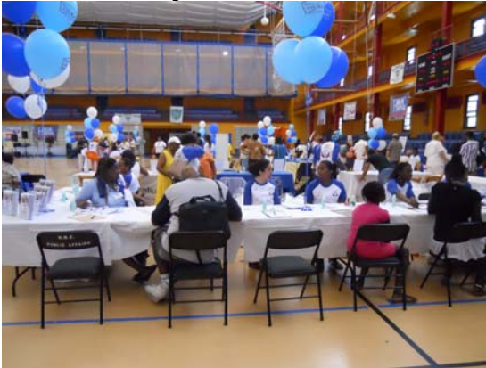
Harlem residents taking the Community Survey

Attendees moved freely throughout the Armory, stopping at various stations to pick up health literature and materials regarding asthma, bariatric surgery, sickle cell, cancer control services, radiology, injury prevention, dialysis, WIC, family planning, pharmacy services, geriatrics programs, the Harlem Adolescent Pregnancy Prevention