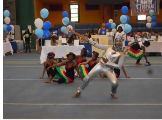
The Harlem Hospital Center's Dance Leadership program pays tribute to Michael Jackson and Lena Horne

Attendees moved freely throughout the Armory, stopping at various stations to pick up health literature and materials regarding asthma, bariatric surgery, sickle cell, cancer control services, radiology, injury prevention, dialysis, WIC, family planning, pharmacy services, geriatrics programs, the Harlem Adolescent Pregnancy Prevention