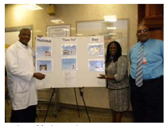
and staff alike. The event was very successful, yielding upwards of 300 participants - many of whom learned something new.

This year, Harlem Hospital celebrated National Time Out Day with an afternoon of interactive activities throughout the facility. The event included tabling in the lobbies of the MLK and RHB as well as sharing health education with patients who visited the Department of Dentistry. Staff from Infection Control, Pharmacy, Anesthesiology, the OR (Nursing), Dentistry and Patient Safety were on hand to share the life saving benefits of Time Out and the Surgical Safety Checklist with patients, visitors