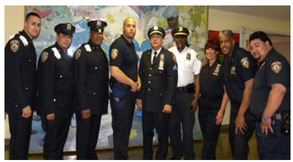
Harlem Hospital Police

Family, friends, colleagues and staff joined in celebration at the 2012 Resident Graduation on May 31, 2012. Congratulations and best of luck to all Harlem Hospital Center physician graduates!