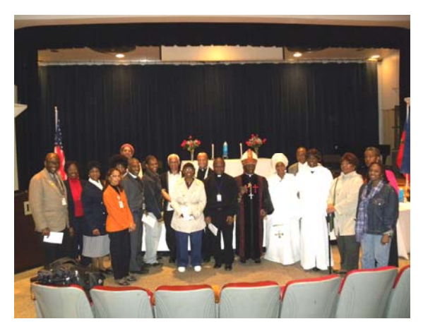
Department of Pastoral Care and attendees of the Interfaith Service of Comfort

On Tuesday, May 18, 2010, Haitian Flag Day, the Department of Pastoral Care warmed the hearts of attendees at the Interfaith Service of Comfort for our Haitian Sisters and Brothers in the Herbert G. Cave Auditorium. The special service was celebrated in English, French and Creole. Prayers, scriptures, songs and words of comfort filled the auditorium, lifting spirits, providing support and assurance that together we can all overcome times of despair.