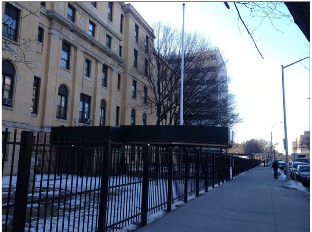
View of hospital building and mowed lawn with trees community, facing south 2