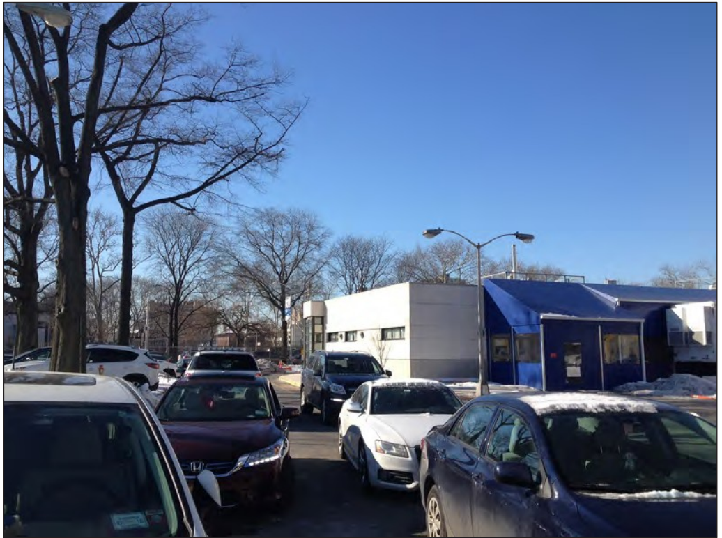
View of parking lot, hospital building, and trees, facing west 3