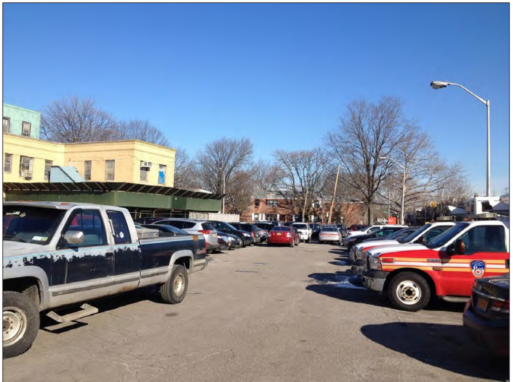
View of parking lot and hospital building, facing north 4