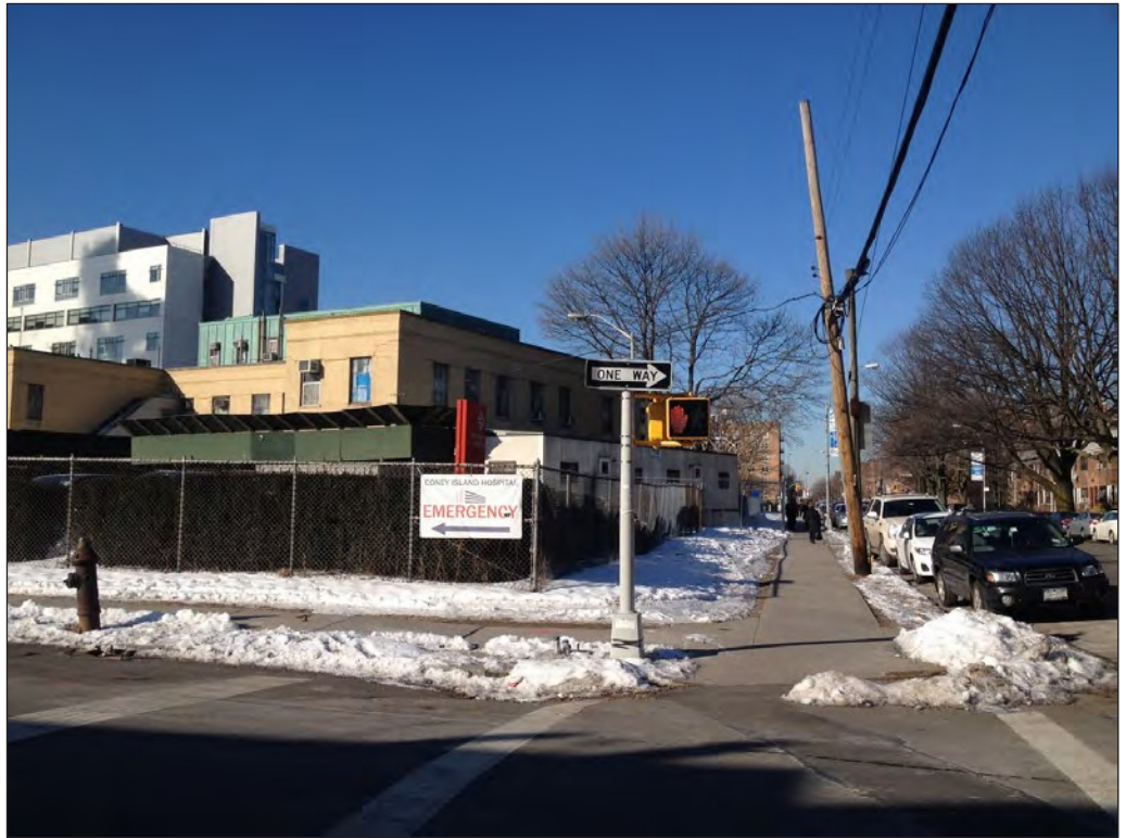
View of hospital building facing west 1