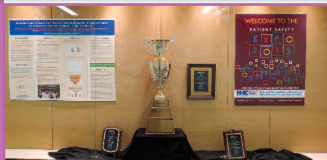
The grand prize trophy is proudly displayed in the Coler campus entrance hall.