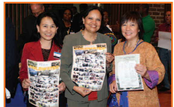
Nursing administrators show off their posters.