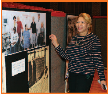
A visual history of Goldwater was on display.