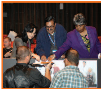
Hors d'oeuvres were served to party attendees.