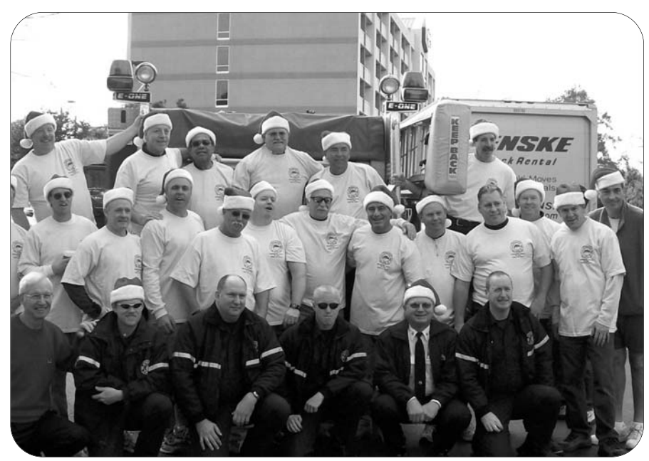
(Above) Twenty-three retired and active firefighters drove seven trucks filled with more than 8,000 toys, food and supplies to Mississippi on behalf of the 9/11 Families for Katrina Relief Foundation.

(Below) FDNY "Santas" make their way to Moss Point, Mississippi.