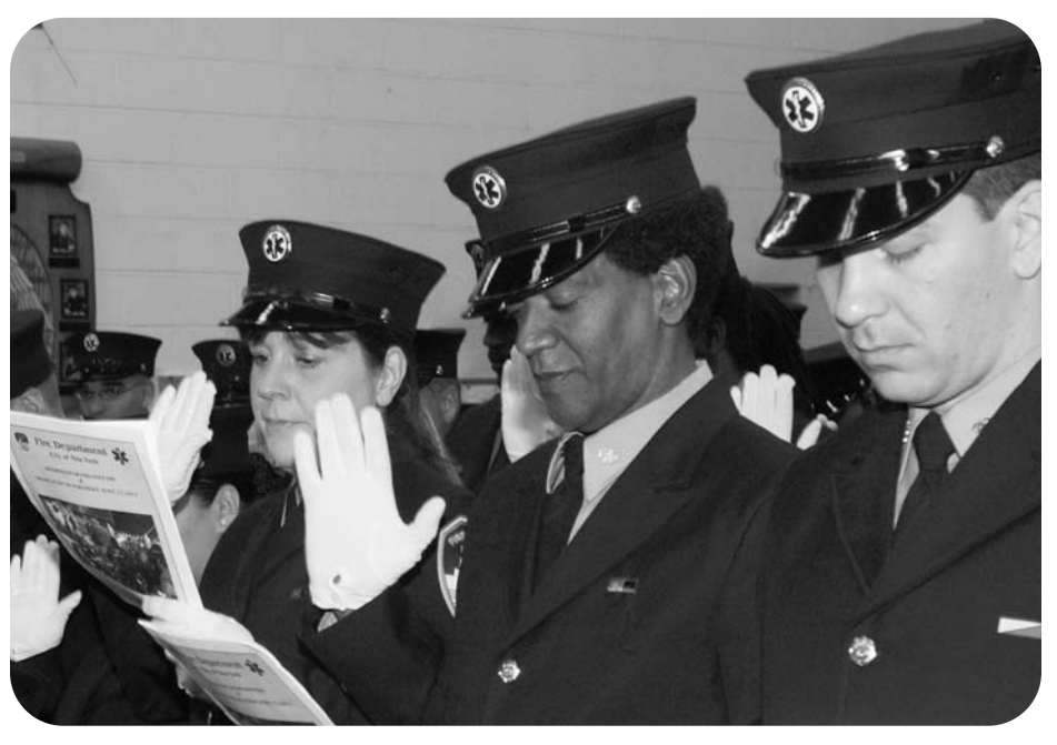
EMTs get sworn in as paramedics during a combined graduation/promotions ceremo ny on November 27. Just a few days later, three of the new paramedics saved three victims of cardiac arrest in the Bronx.

EMTs began giving CPR. didn't look good."