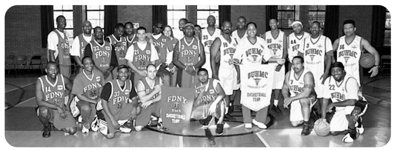
Members of EMS Stations 39 and 44, and Battalion 38 join physicians from Brookdale University Hospital Medical Center for a charity basketball game on November 25, benefiting the Marines Reserves' Toys for Tots Program.

embers of EMS Division 3 played a friendly game of hoops with physicians from Brookdale University Hospital Medical Center November 25 to raise funds for the Marine Reserves' Toys for Tots Program.