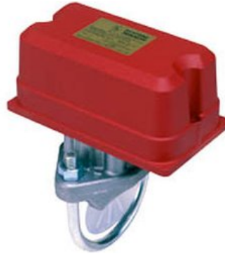
Water flow detector