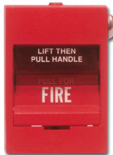
Double action station

The Certificate of Fitness holder must know how to manually operate each alarm station on the premises. Once activated, the fire alarm system can not be re-set at the fire alarm manual pull station. The alarm must be re-set at a main FACP after the pull station reset to its normal condition. The alarm may be turned off only by a Certificate of Fitness holder or by a Fire Department representative. Once activated, a key may be required to reset the manual pull station.