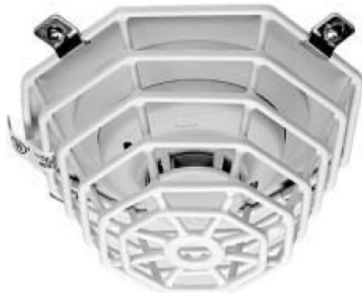
Heat detector with protective mechanical guard