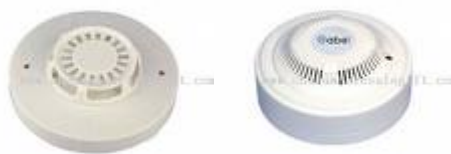
Fixed- temperature heat detectors

The fixed-temperature heat detectors are most commonly used. The detectors consist of two electrical contacts housed in a protective unit. The contacts are separated by a fusible element. The element melts when the temperature in the room reaches a preset level. This allows the contacts to touch. When the contacts meet the detector activates the fire alarm.