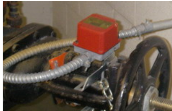
Tamper switch on a sprinkler valve