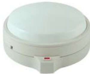
Rate-of- rise heat detector

All heat detectors require special attention. They must be carefully installed according to the manufacturer's instructions.