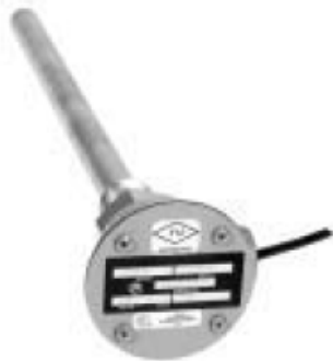
Temperature Supervisory Switch