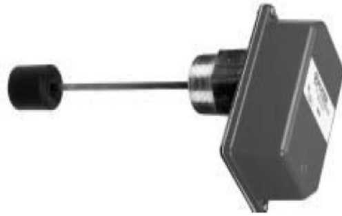
Tank Water Level