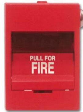
Single action stations

4. B. Double action stations: Double action stations require two steps in order to activate the alarm. The user must first break a glass, open a door or lift a cover. The user can then gain access to a switch or lever which must then be operated to initiate an alarm. To activate this type of alarm station the cover must be lifted before the lever is pulled. This kind of double action station is often found indoors. Another kind of double action break glass station requires someone to break a small pane of glass with a small metal mallet.