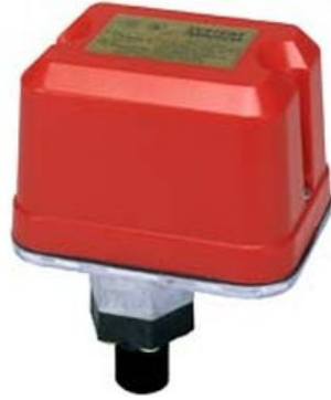
Pressure Supervisory Switch Supervisory Switch