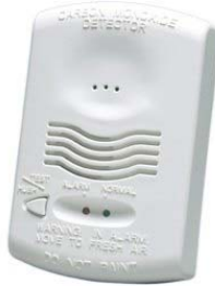
Carbon monoxide detector

Carbon monoxide detectors are required in any building that has fossil (gas and oil) fuel burning equipments.