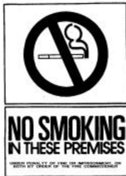
NO SMOKING SIGN

Motor fuels are flammable and easily ignited. For this reason no smoking is permitted anywhere on the premises. The penalty for smoking is a fine up to $500.00, and/or imprisonment for up to 6 months. This applies to customers as well as employees. Signs must be constructed of a durable metal and posted indicating that no smoking is permitted on the premises and must include procedures to be followed in case of a fire emergency.. There will be no servicing or repair of motor vehicles in areas used for dispensing. An example of a No Smoking sign is shown below: