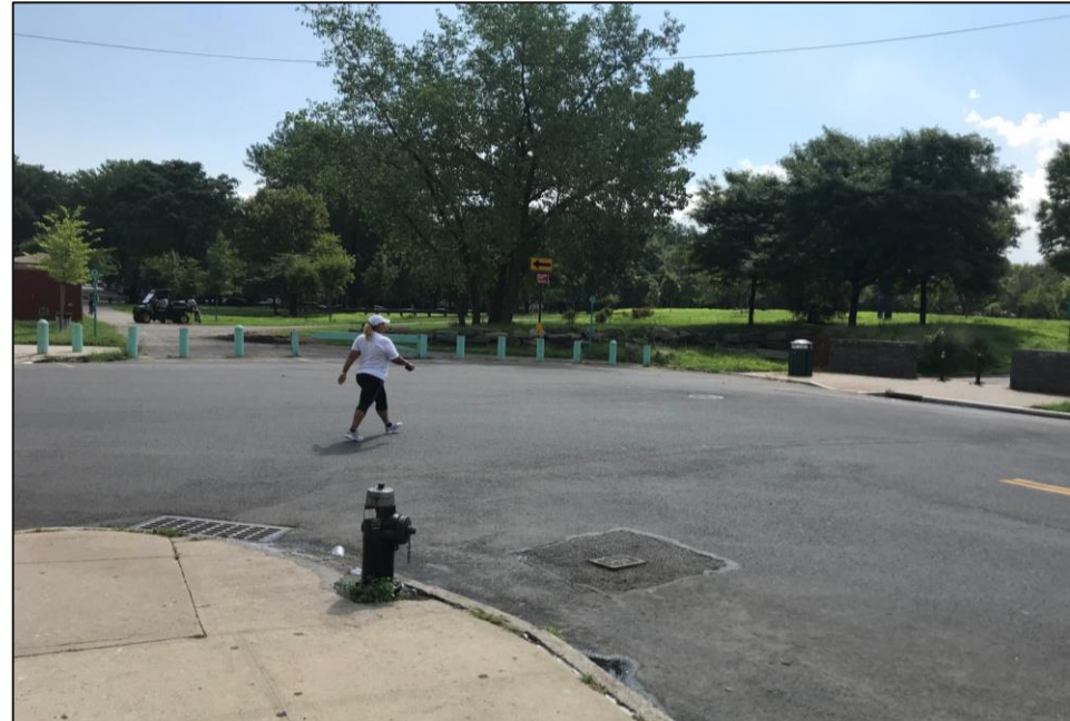
Before: Lafayette Ave and Morrison Ave