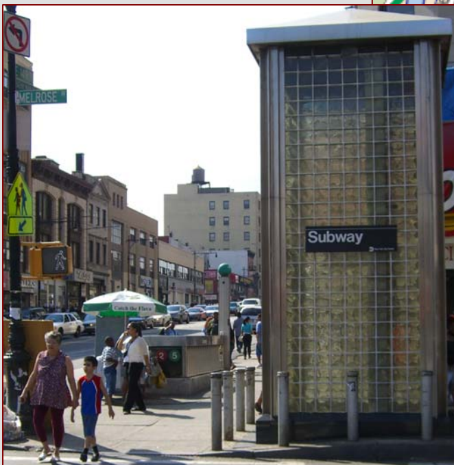
2/5 Third Ave-149 th Street Subway Station