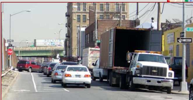
Existing Lane at 173 rd Street