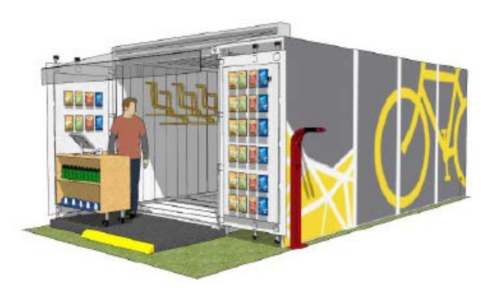
Example only. Not final exterior design.