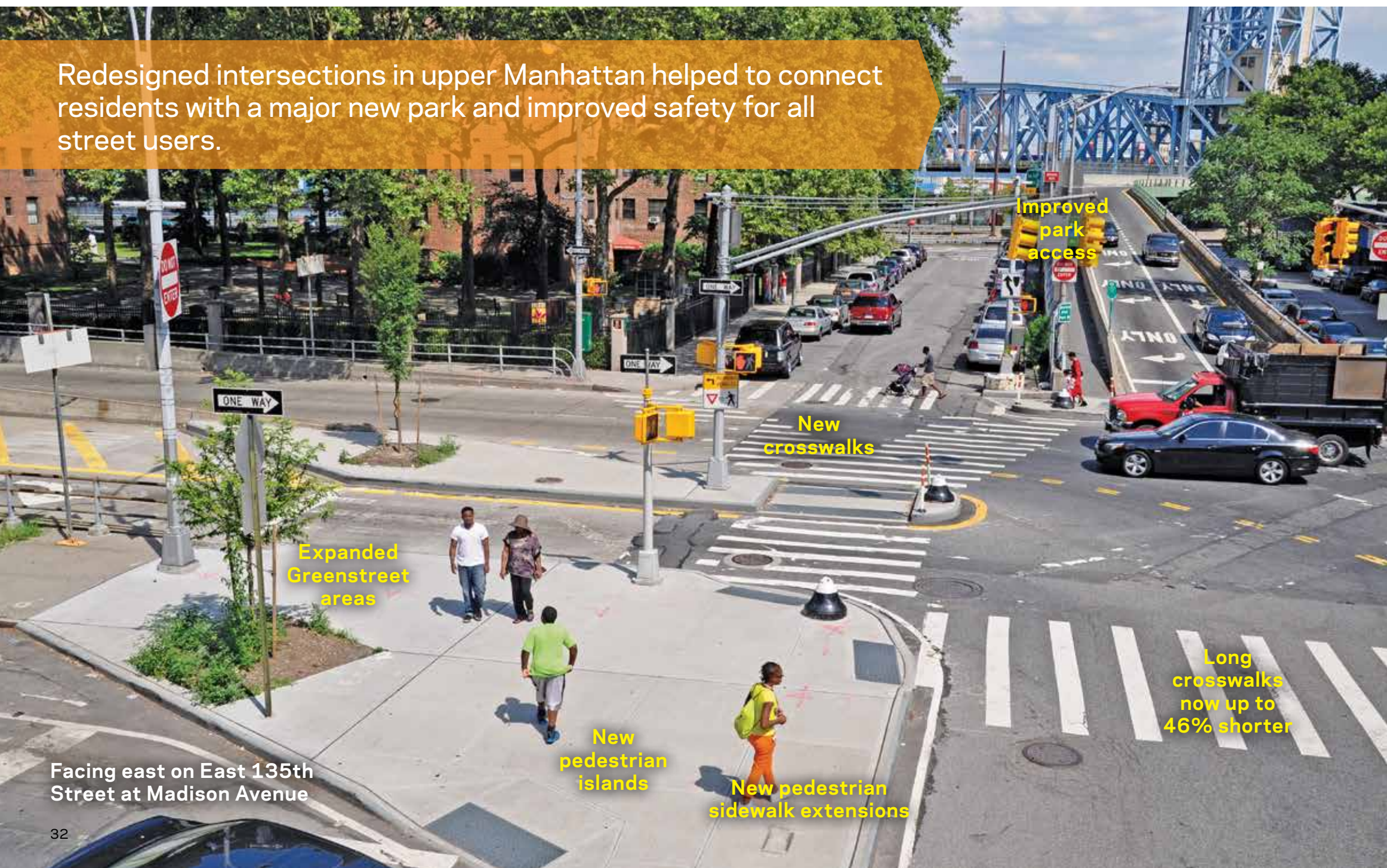
Facing east on East 135th Street at Madison Avenue

Redesigned intersections in upper Manhattan helped to connect residents with a major new park and improved safety for all street users.