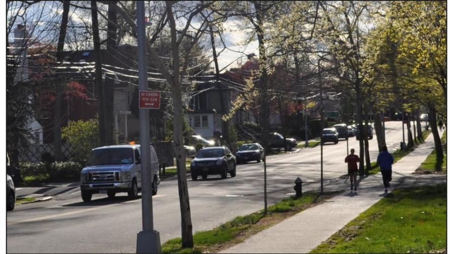
Before Conditions: 32 nd Ave at Bowne Park