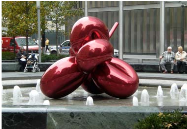
Plazas may include temporary or permanent art.