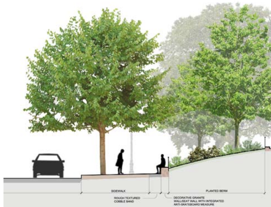
DOT will fund plaza design and construction.

As needed, DOT will monitor and inspect the plazas to assess and confirm that the Partners are fulfilling their responsibilities as set forth in the agreement.