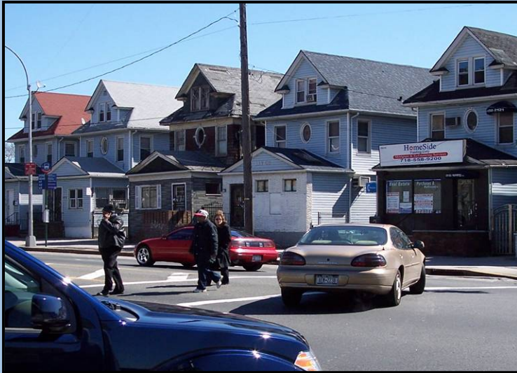
Pedestrians crossing Hillside Avenue at 184th