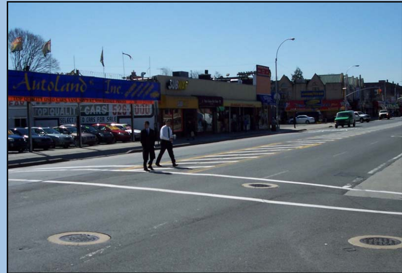
Pedestrians crossing Hillside Avenue at 182nd