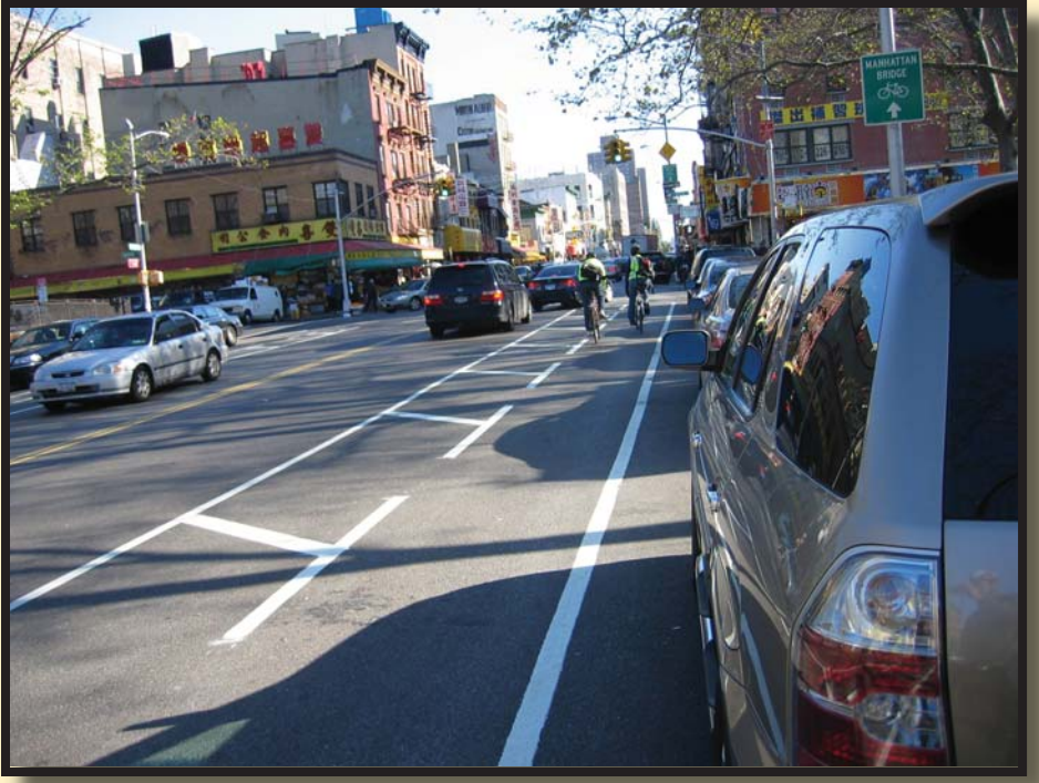
Perspective of eastbound Bike Lane at intersection of Grand Street and Forsyth Street

While Grand Street provided a safer, more appealing route, there were still certain safety concerns do to the elements listed, mainly excessive width and low traffic volumes. This contributed to a high incidence of speed, especially along the eastern portion of the corridor. Accordingly, the Department developed a new street design that take into all roadway users; pedestrians, motor vehicle drivers and cyclists alike and provides for a set of safety improvements that provide benefits to all users. Most notably, the reduction in travel lanes and width will lead to decreased speeds and a safer cycling environment. In addition, this program allows for early implementation, with flexibility for future improvements such as a raised median.