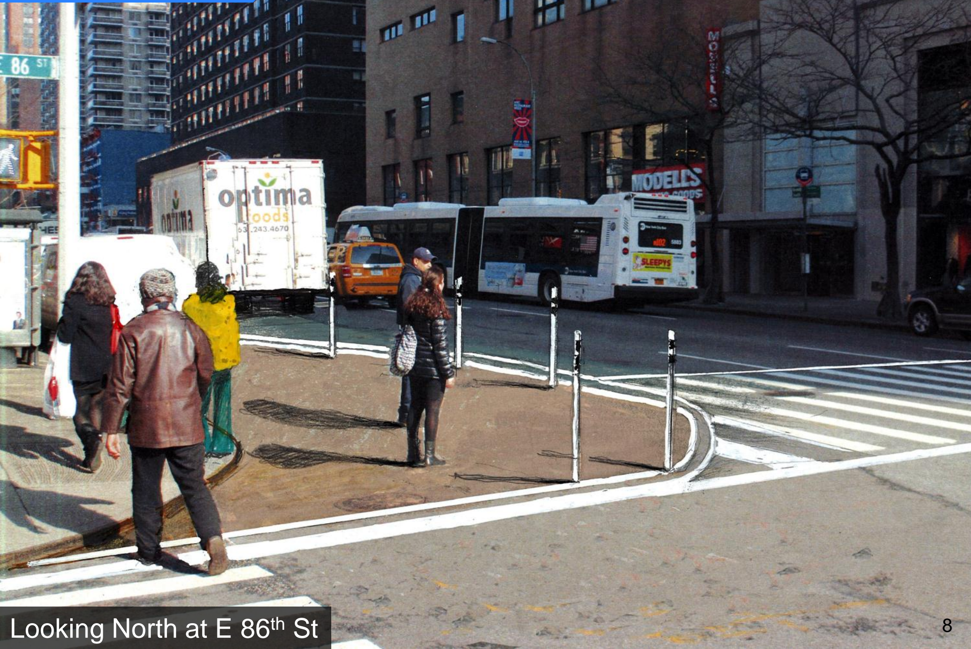
Looking North at E 86 th St