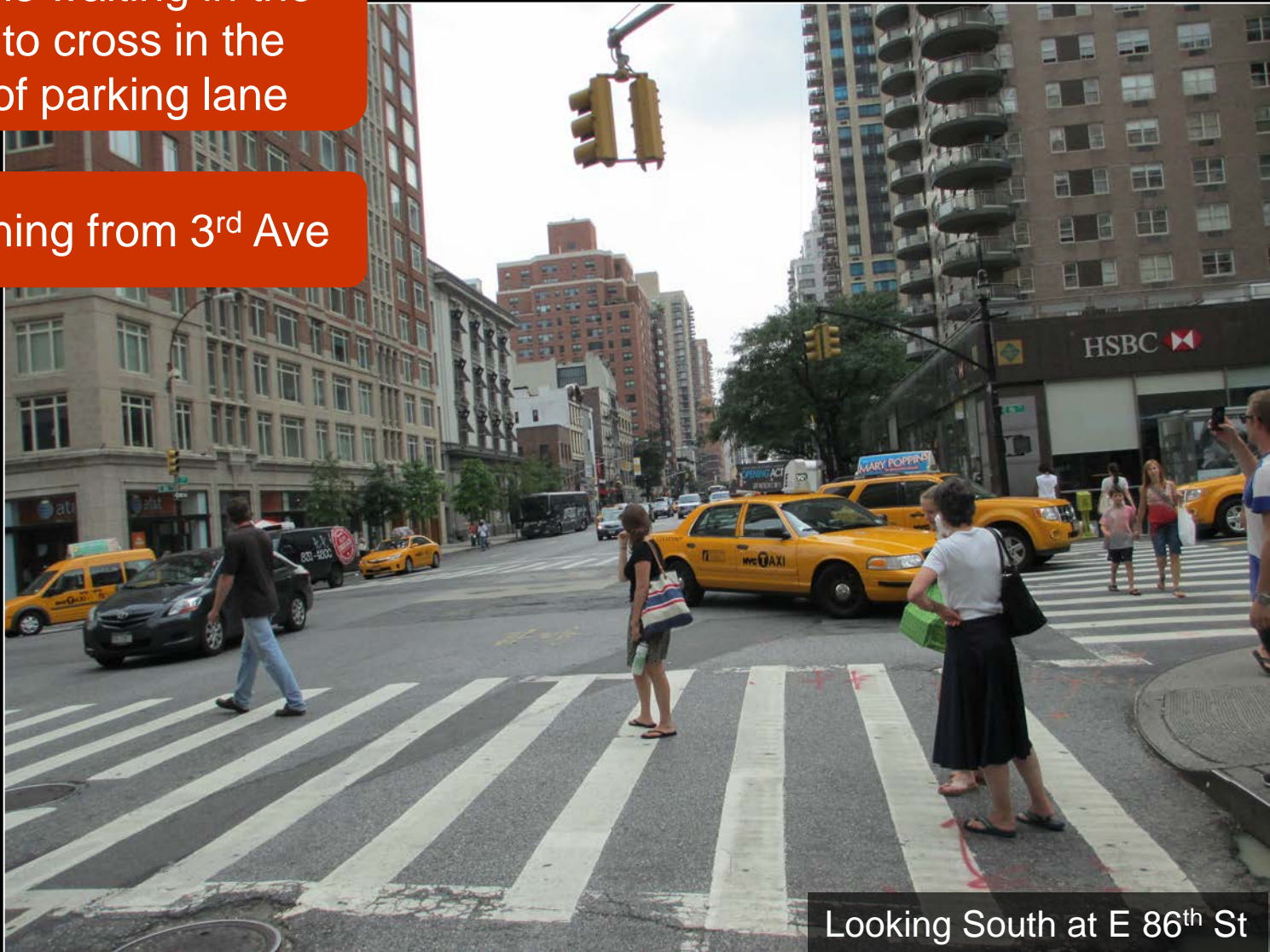
Looking South at E 86 th St