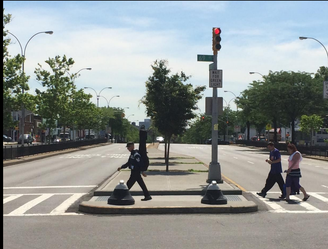
Queens Blvd and 69 St