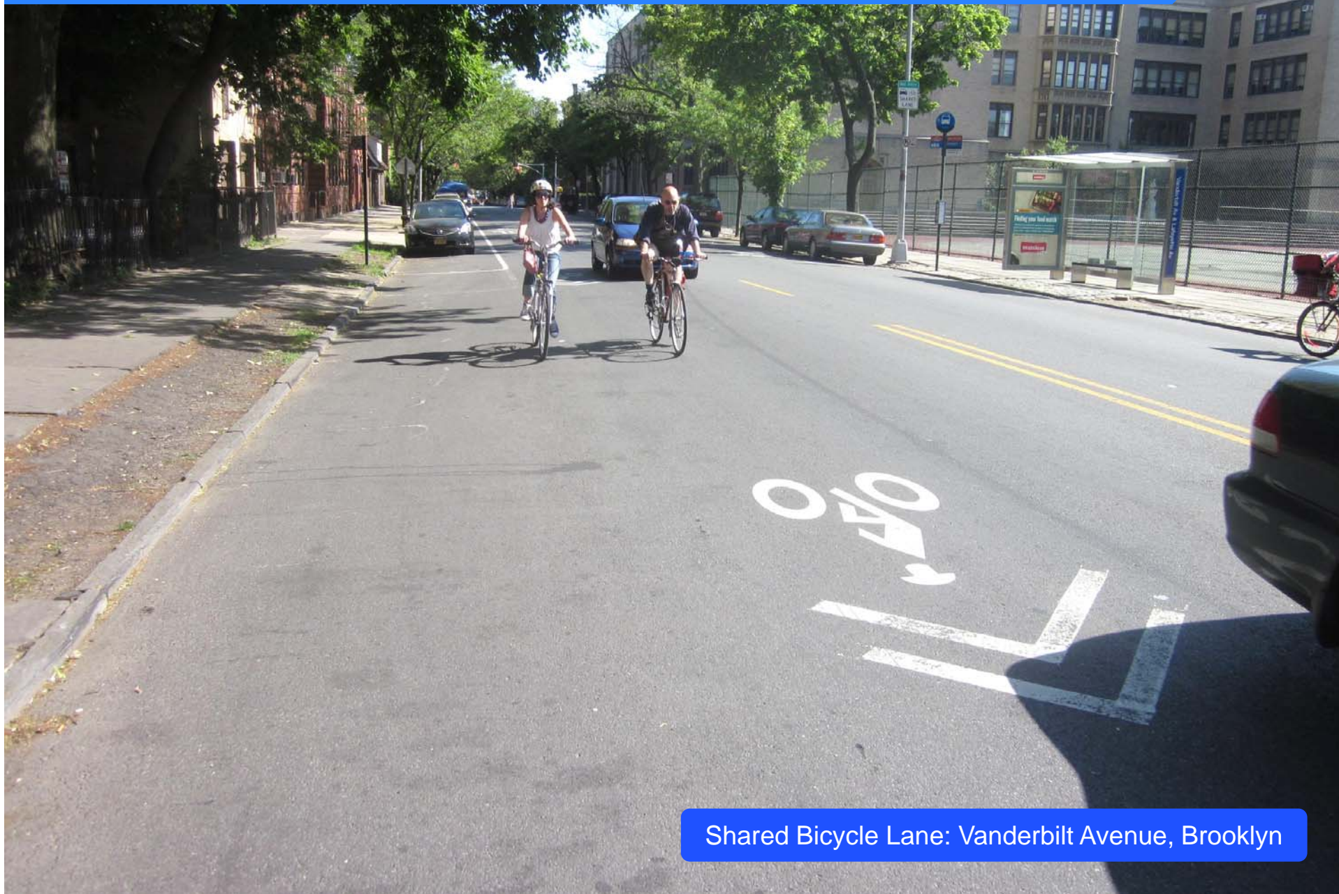
Shared Bicycle Lane: Vanderbilt Avenue, Brooklyn