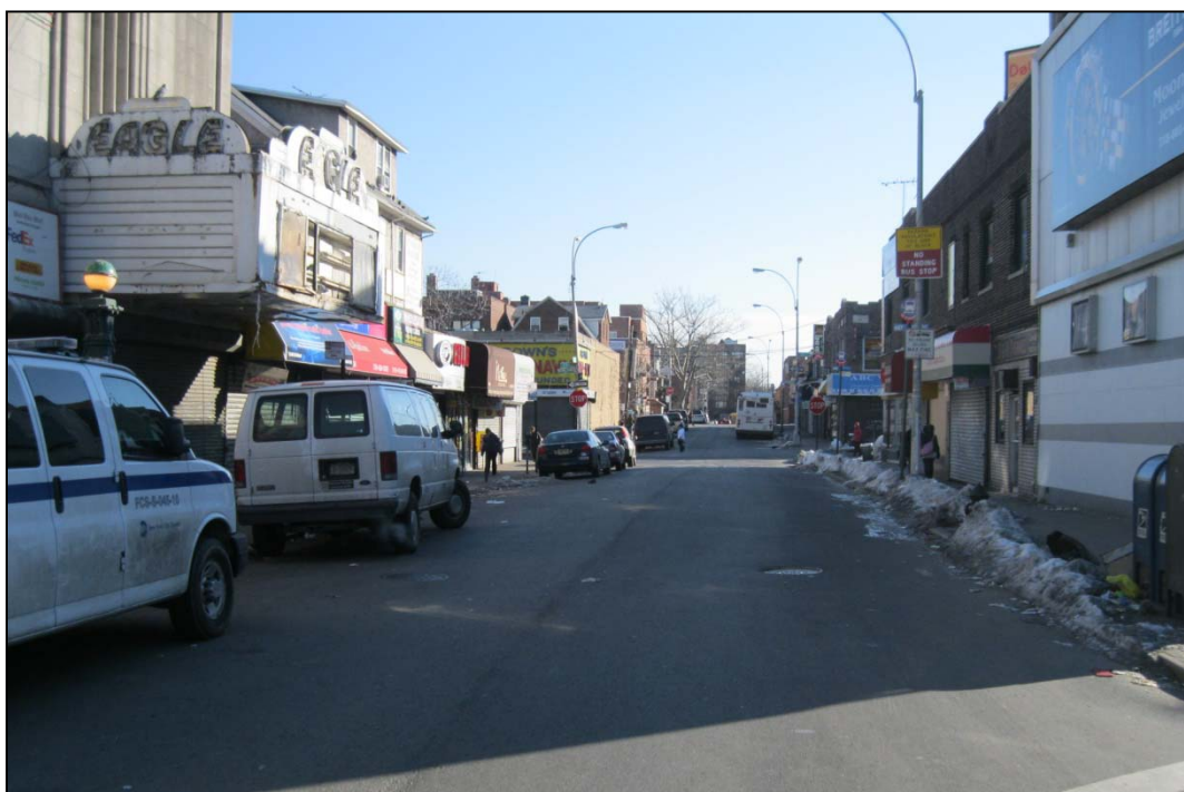
Before: 37th Road between 73rd and 74th Streets, looking east