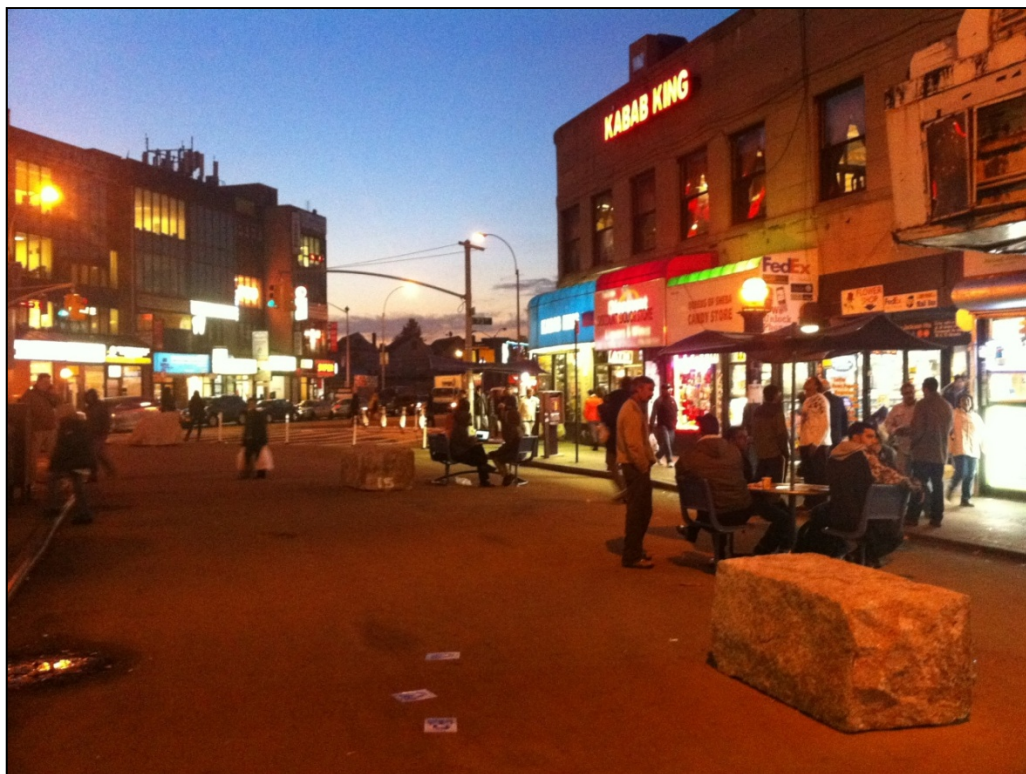
After: Plaza space on 37th Road between 73rd and 74th Streets