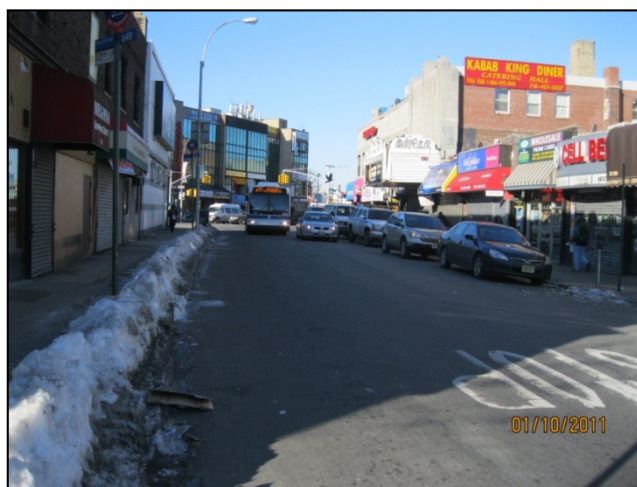
Before: 37th Road between 73rd and 74th Streets