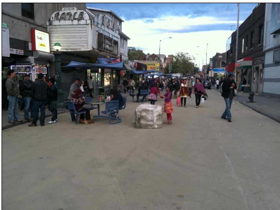
After: Plaza space on 37th Road between 73rd and 74th Streets