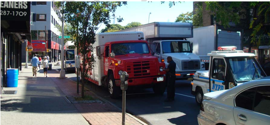
Truck receiving a summons for parking in a bus stop on Church Avenue (between East 19 th Street and Ocean Avenue, north curb), 9-20-2010