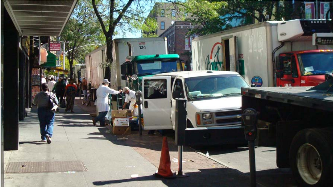
Trucks delivering to merchants on Church Avenue (between East 18 th Street and East 19 th Street, north curb), 9-20-2010