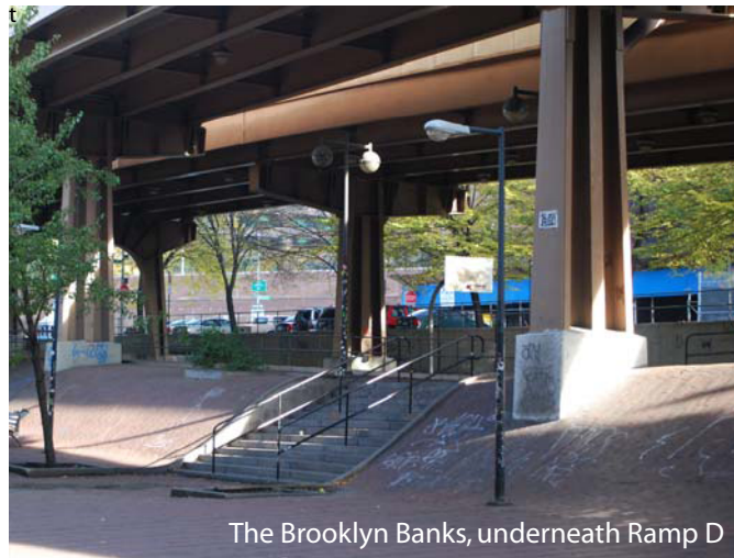
The Brooklyn Banks, underneath Ramp D

The contractor installed protective guards around the trees at the end of March, and expects to place a concrete barrier along the perimeter of the shaded section on or around May 15 th . Fencing will be installed after the concrete barriers are in place. Setting up this staging area is expected to continue until approximately May 30 th . DOT is continuing to work with the communities using this area, to maintain as much access as can be safely accommodated, including the potential relocation of skate areas into areas outside of the staging area. During a 4-6 month period beginning in mid-2010, the entire area will be closed due to overhead paint work. DOT expects to re-instate partial access after this work is completed.