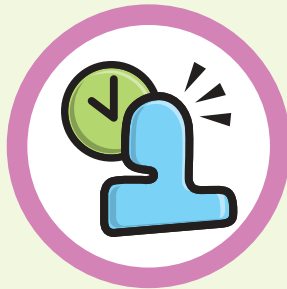
Cope with Stress