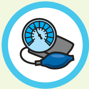
Monitor My Blood Pressure at Home