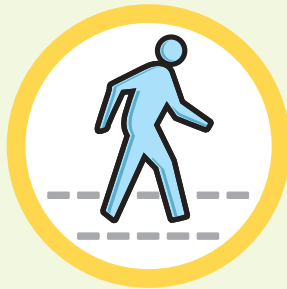
Be Physically Active