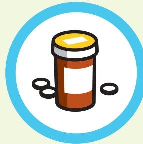
Take My Medicine