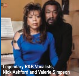
Legendary R&B Vocalists, Nick Ashford and Valerie Simpson

50 OR OLDER? IT'S TIME FOR A COLONOSCOPY—NOW!