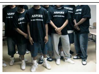
NSD residents sport ASPIREwear during SEEDS summer leadership program for youth.

Section 2 focused on teambuilding activities. Each week, 70 residents participated in SEEDS-conducted exercises designed to promote team spirit and strengthening themselves as one unit through several sports programs (flag football, basketball, softball for male residents and volleyball, double dutch, and softball for female residents) where fair play, sportsmanship, and positive reinforcement was the focus, not the resulting scores. Each facility appointed a staff member and resident who actively participated in coaching its team.